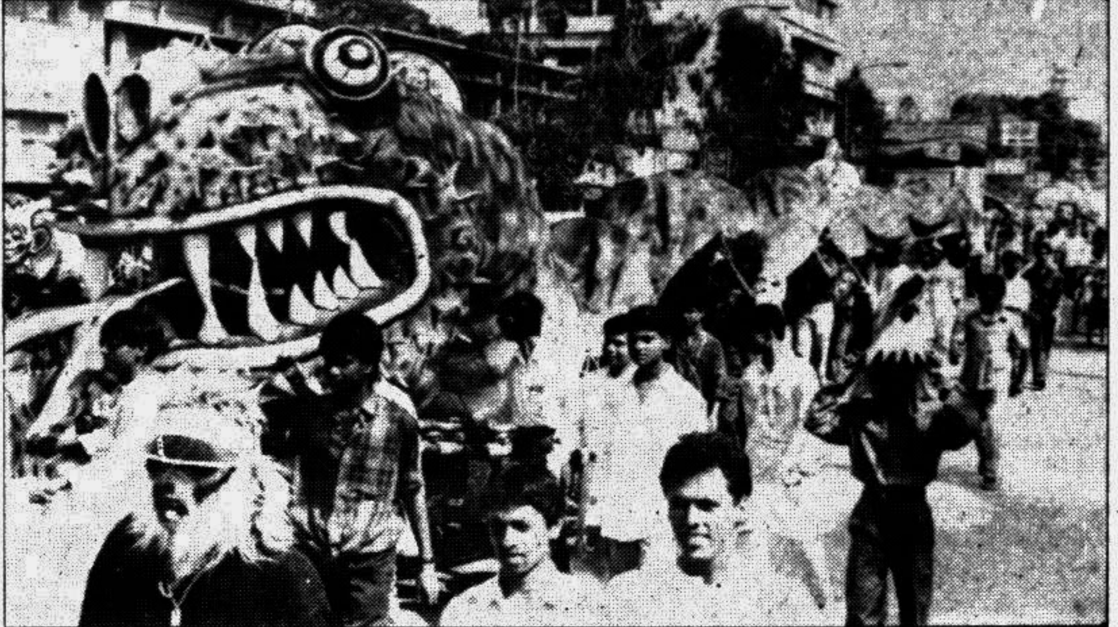
A mythical dragon forms part of the rally brought out in the city on Thursday in celebration of the Bengali New Year's Day.