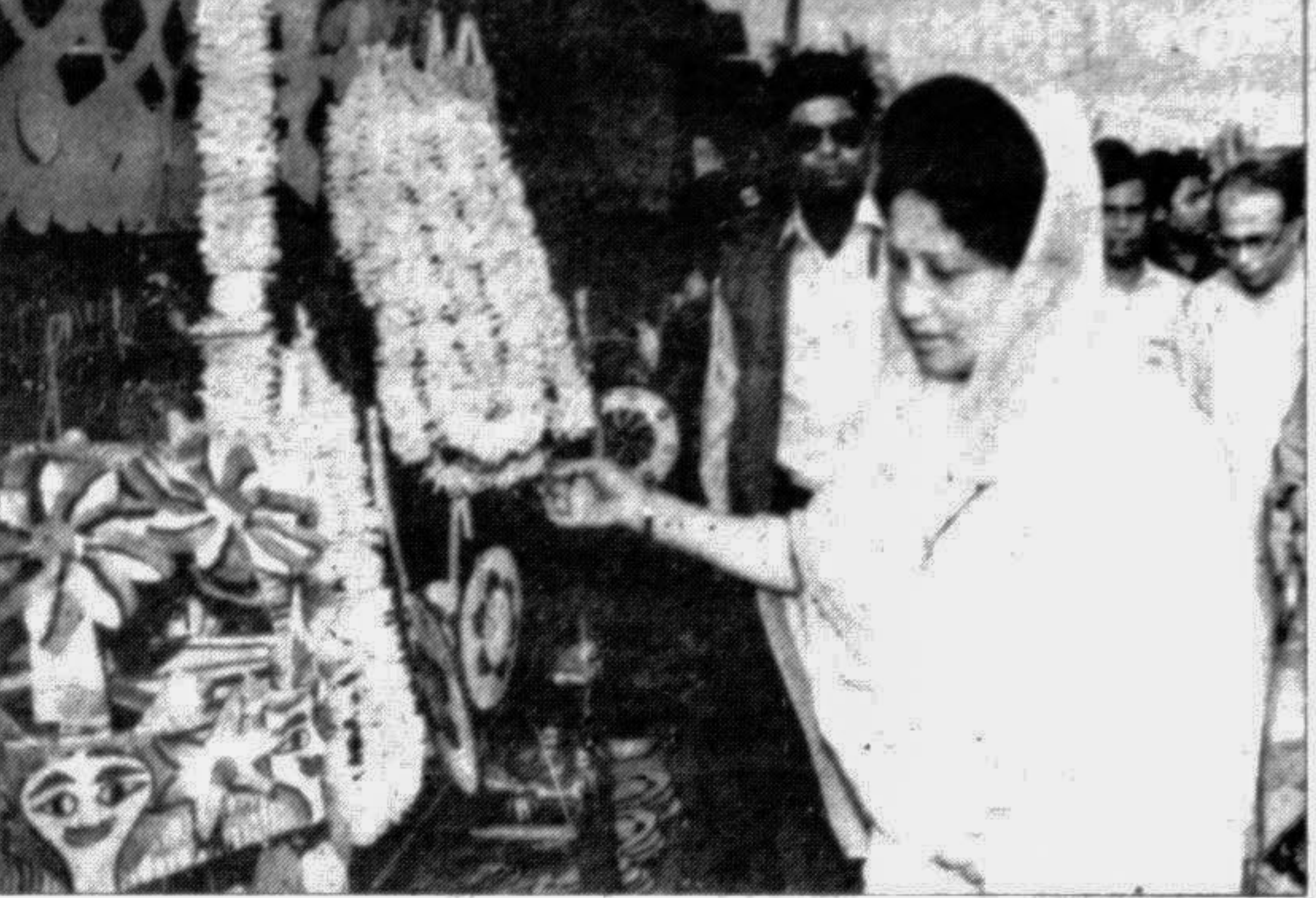
Prime Minister Begum Khaleda Zia went round different stalls after inaugurating the week-long Baishakh mela organised by the Bangladesh Small and Cottage Industries Corporation at the Dhanmondi Club ground in the capital Thursday.