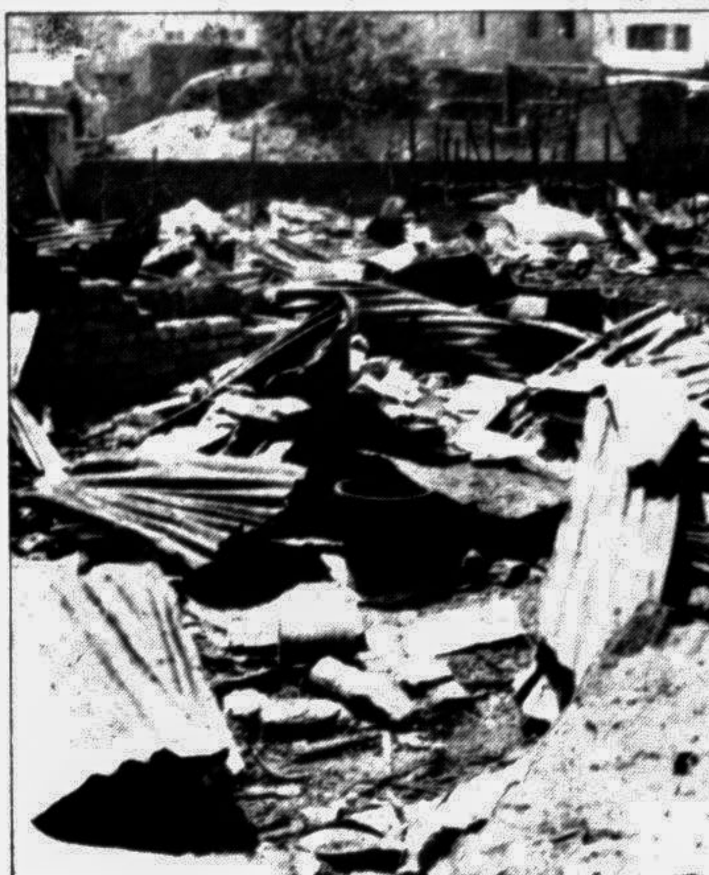
A fire at city's East Raja Bazar area gutted about 115 houses yesterday.