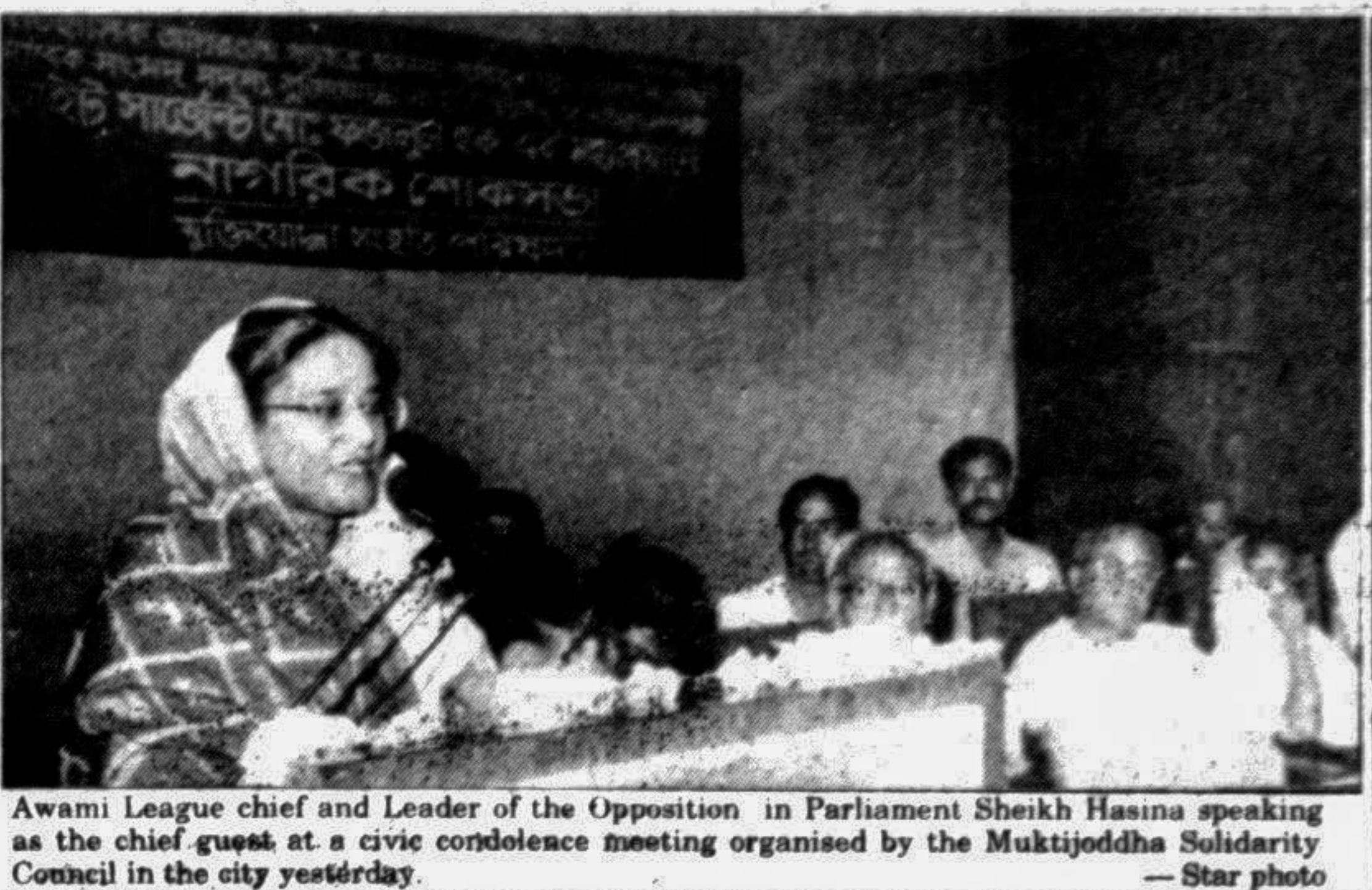
Awami League chief and Leader of the Opposition in Parliament Sheikh Hasina speaking as the chief guest at a civic condolence meeting organised by the Muktijoddha Solidarity Council in the city yesterday.