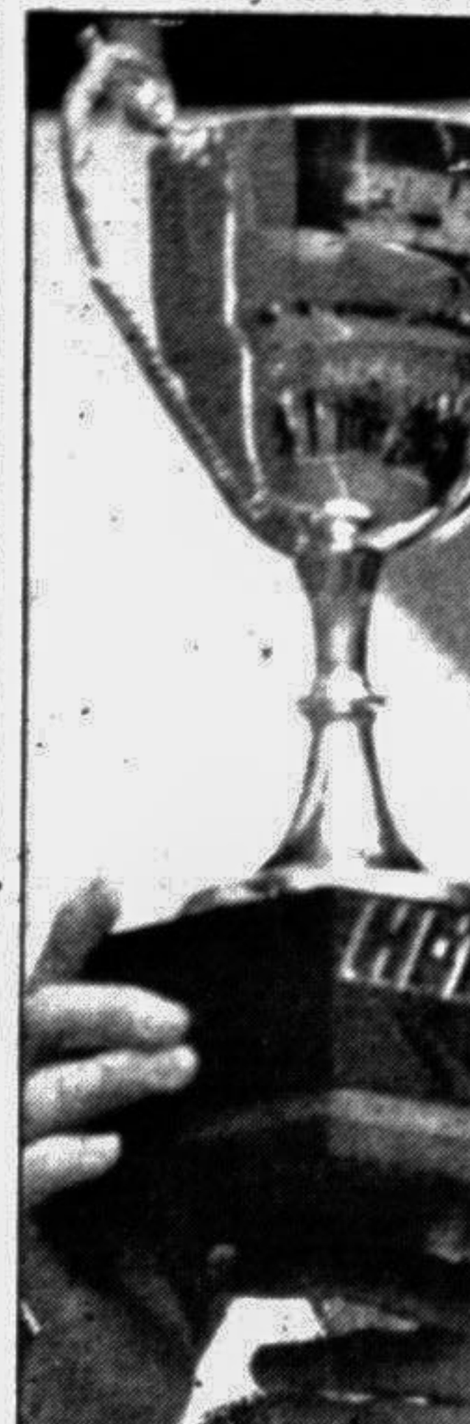
World champion Jansher Khan of Pakistan holds the British Open men's squash title after beating Australian Brett Martin 9-1, 9-0, 9-10, 9-1 in the final in London on Monday. It was Jansher's third consecutive British Open win.

LONDON. Apr 12: Jansher Khan landed his third consecutive British Open squash title on Monday with a 9-1, 9-0, 9-10, 9-1 victory over Australian Brett Martin, reports Reuter. It was a comprehensive 62-minute success for the Pakistani world champion, who at one stage looked set to inflict one of the worst drubbings in the event's history on the world number two and second seed.