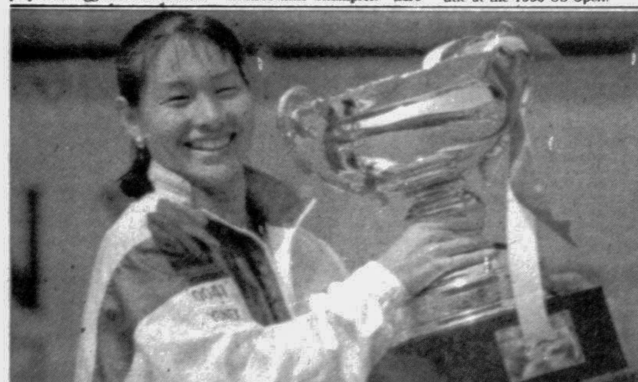
All all-smile Kimiko Date holds the Japan Open trophy aloft after beating American Amy Frazier 7-5, 6-0 in the final in Tokyo yesterday.

The sixth-ranked Sabatini suddenly appears to have rediscovered her talent as well as the attacking game that brought her lone Grand Slam title at the 1990 US Open.