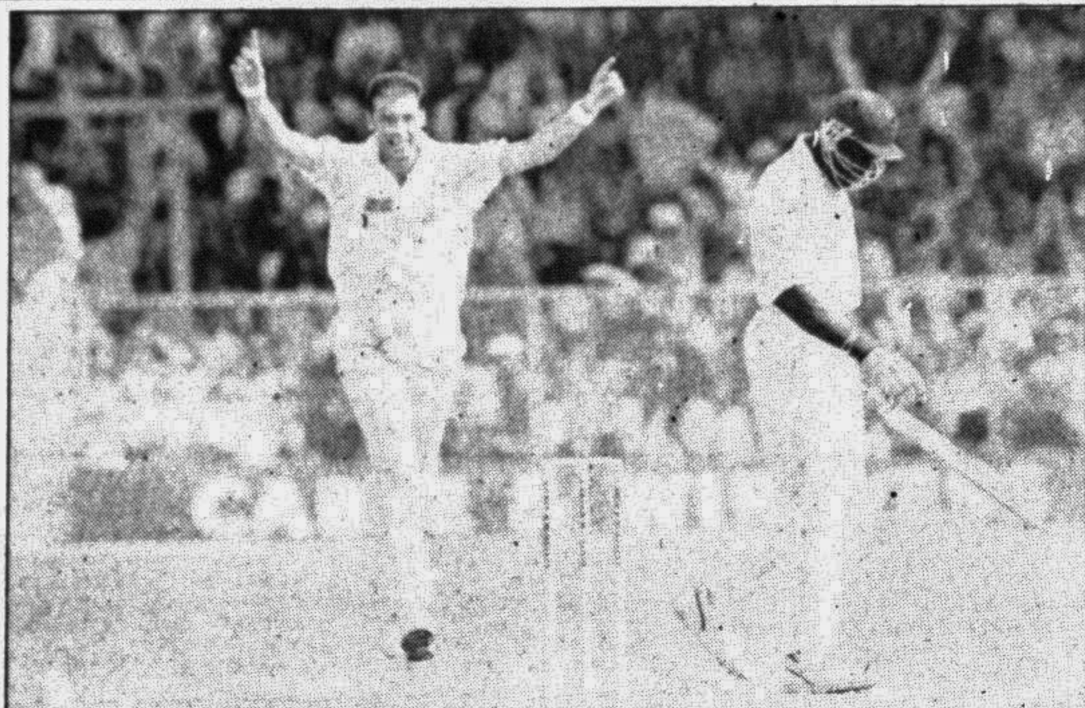
West Indian Winston Benjamin starts his long walk back to the dressing room after edging Angus Fraser to Graeme Hick during second day's play of the fourth Test against England at the Kensington Oval, Barbados on Saturday. Fraser finished with fantastic figures of six for 47, leaving the home side 188 for seven at stumps.

It's still pretty Fanny's way for England