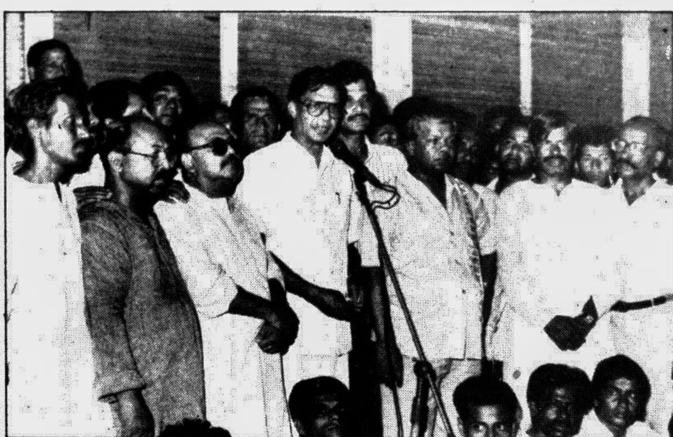
Mohammad Hanif, Mayor of Dhaka City Corporation (DCC) addressing a public meeting in front of the Awami League central office after the hartal hours yesterday.