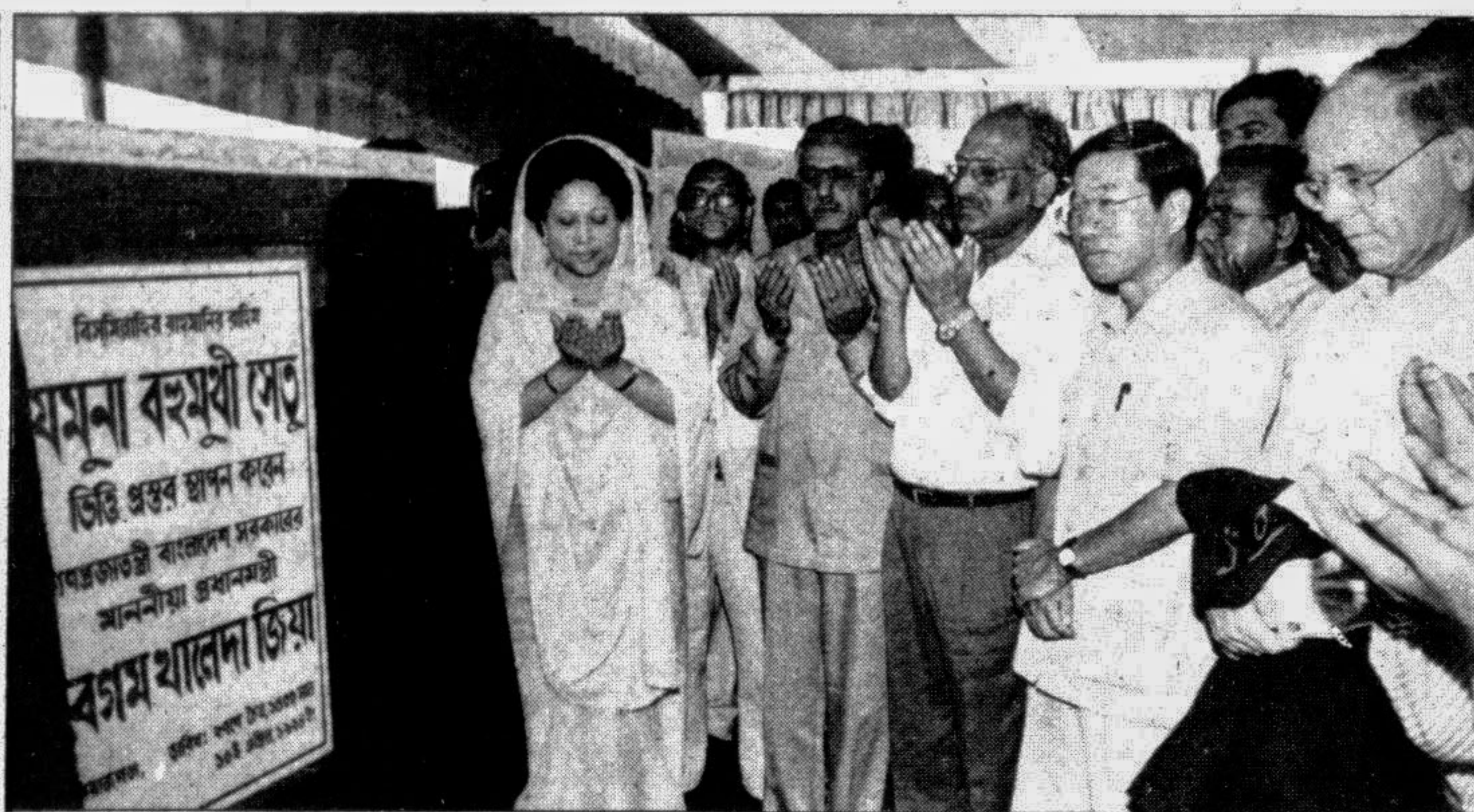
Prime Minister Begum Khaleda Zia offering munajat after unveiling the plaque of the foundation stone of the Jamuna Multi-purpose Bridge at Syedabad in Sirajganj yesterday. Her cabinet colleagues and representatives of the donor agencies are seen on her left.