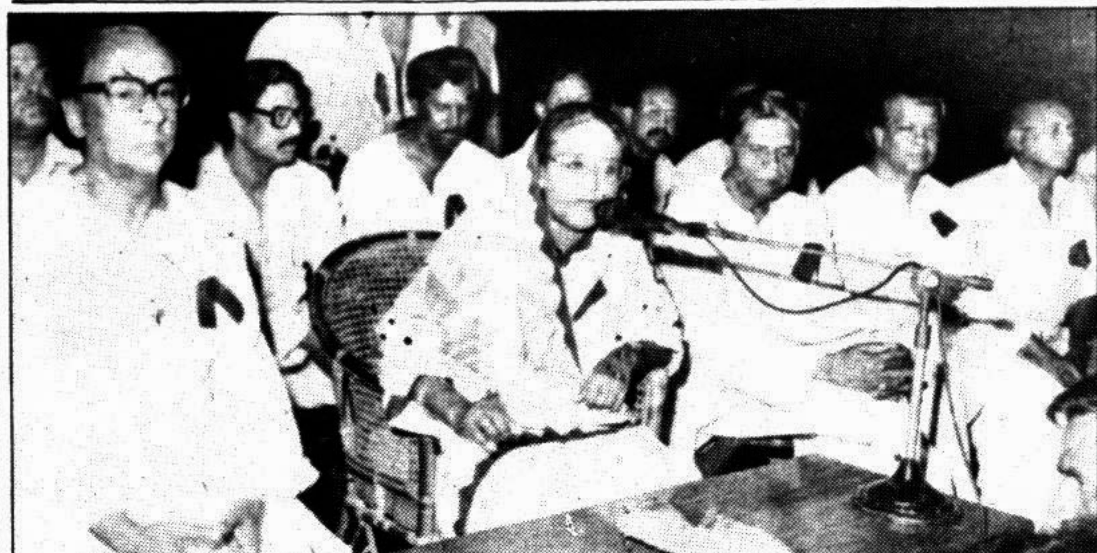
Awami League chief and Leader of the Opposition in Parliament Sheikh Hasina addressing a meeting of the Dhaka city unit of her party at her Minto Road residence in the city yesterday.

Endeavour holds what NASA says is the finest space radar ever designed for environmental research.