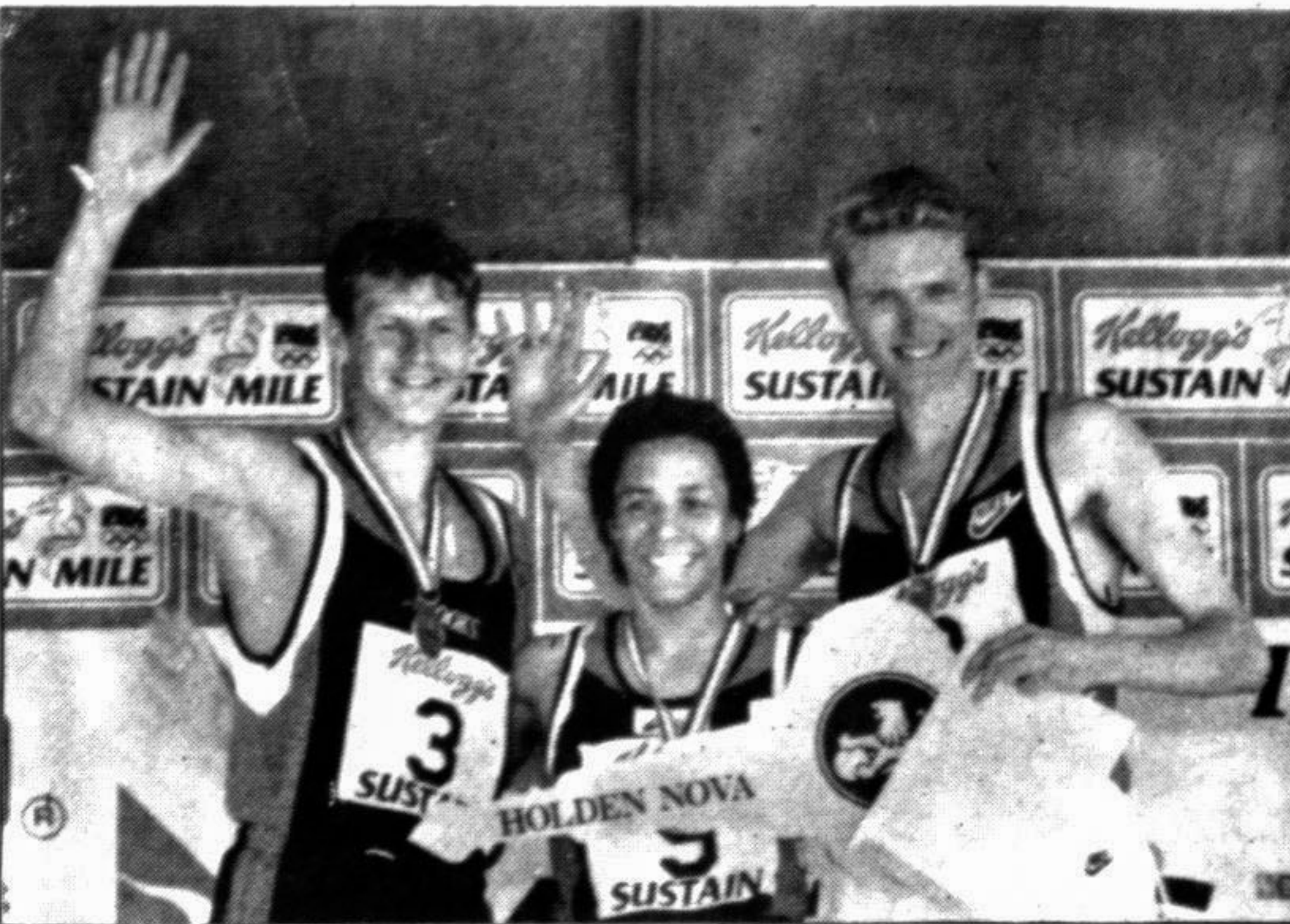
HAPPY TRIO: British number one Matthew Yates (R) celebrates his victory in the Sydney mile roadrace with compatriots runner-up Steve Cram (L) and women's winner Kelly Holmes (C) in Sydney yesterday.