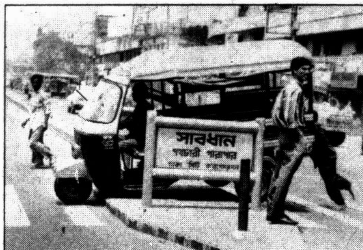
An auto-tempo, a three wheeler, is seen using the zebra crossing for a road cross. The picture was taken from the city's Framgate area yesterday.