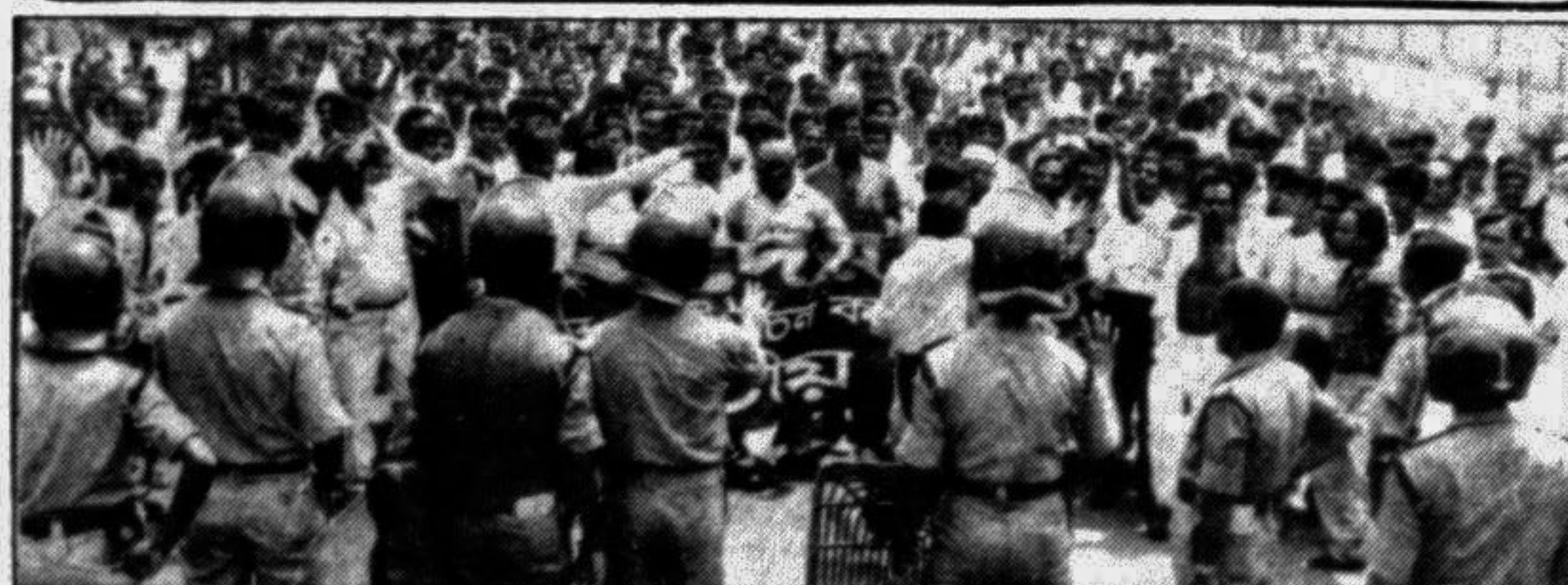
A procession of the Jatiya Party in front of the Election Commission office in the city yesterday.

BANGLADESH TOBACCO COMPANY LIMITED বাংলাদেশ টোব্যাকো কোম্পানী লিমিটেড