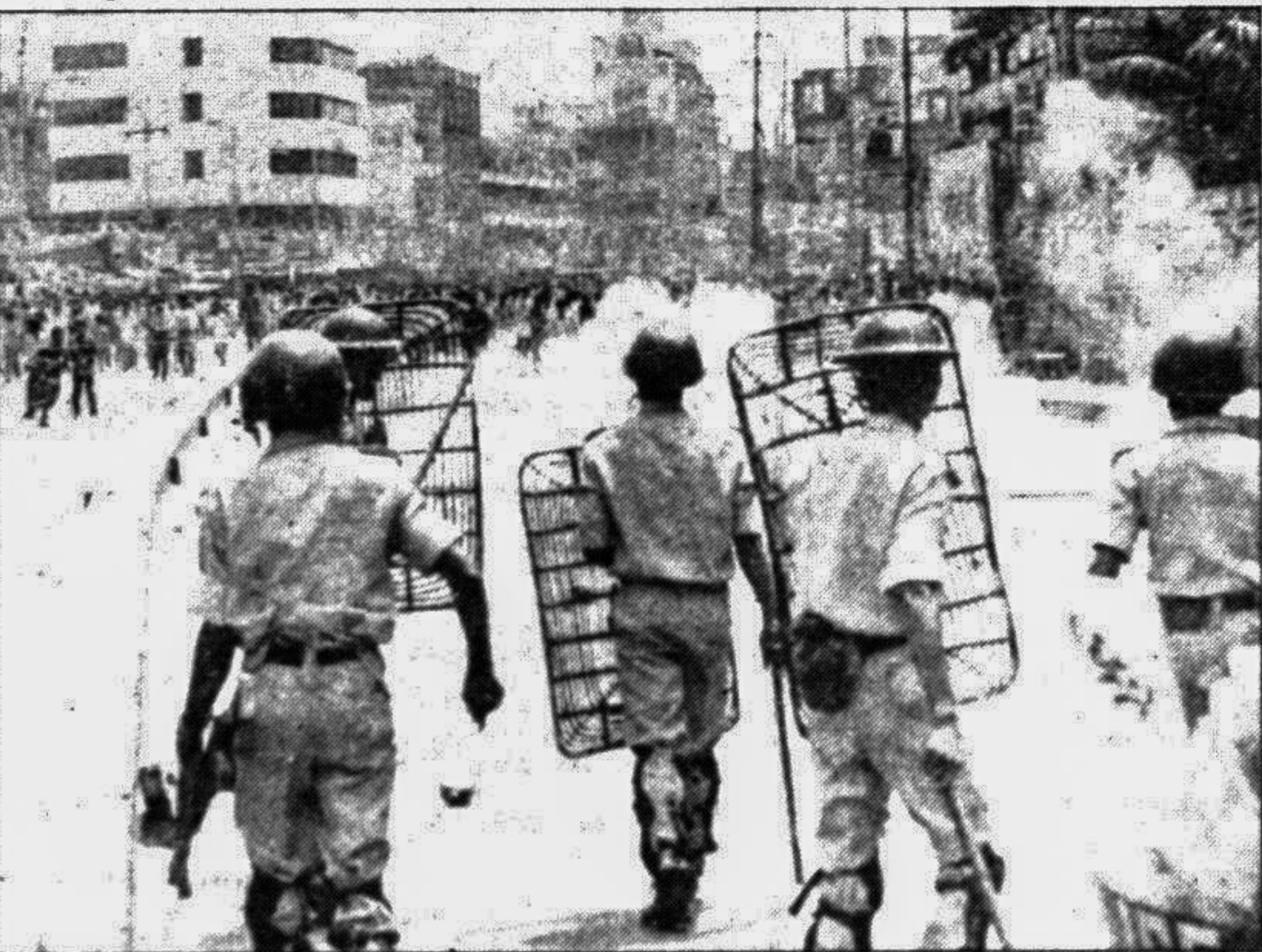
Riot police armed with tear-gas guns, shields and truncheons march under a heavy cover of tear-gas smoke towards stone-throwing demonstrators at the North South Road in the city yesterday.

by AL activists and sporadic police baton-charges kept the area near the Star Gate of the Ramna Park — some 150 yards from the Foreign Office — tense during the planned siege.