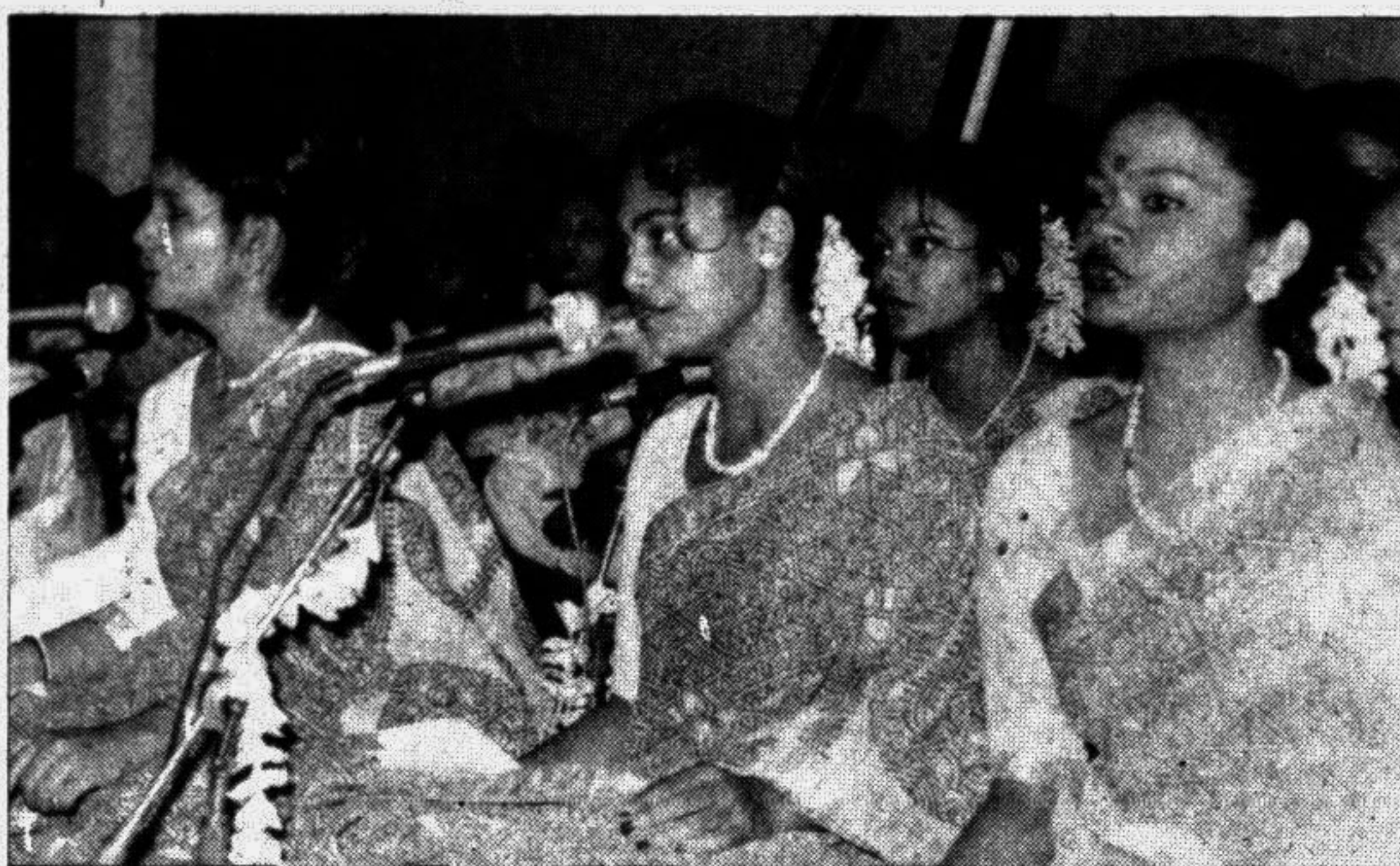
Members of Surer Dhara presenting songs at the National Museum auditorium in the city yesterday marking the organisation's second founding anniversary.