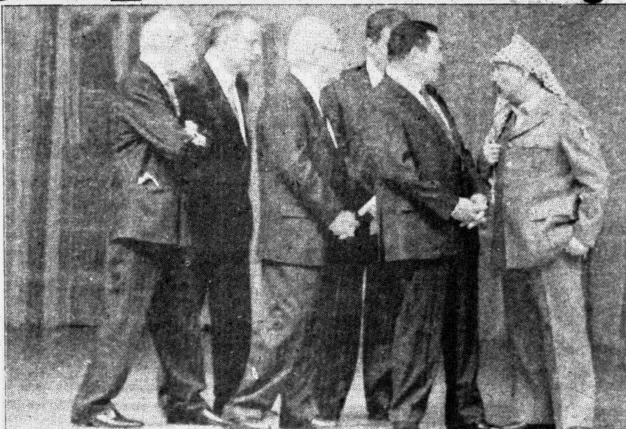
(From L to R): Foreign Ministers Shimon Peres of Israel, Russian Alexander Kozyrev, Egypt's Amr Moussa, Israeli Premier Yitzhak Rabin and Egyptian President Hosni Mubarak entreat PLO Chairman Yasser Arafat after he refused to sign a document of the Gaza-Jericho autonomy deal in Cairo yesterday.