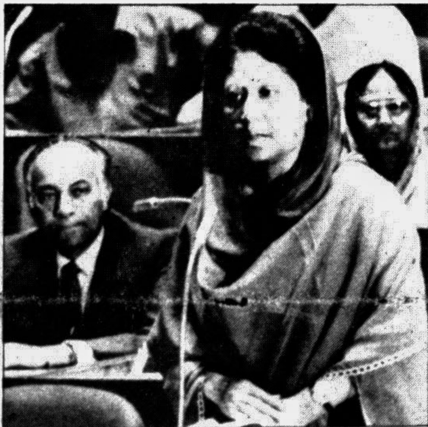
Prime Minister Begum Khaleda Zia addressing the opening sitting of the 14th session of the fifth Jatiya Sangsad yesterday.

The Leader of the Jatiya Sangsad and Prime Minister Begum Khaleda Zia yesterday made an appeal to all the Opposition MPs to attend Parliament session for resolv- ing the national problems through discussions on the floor of the House.