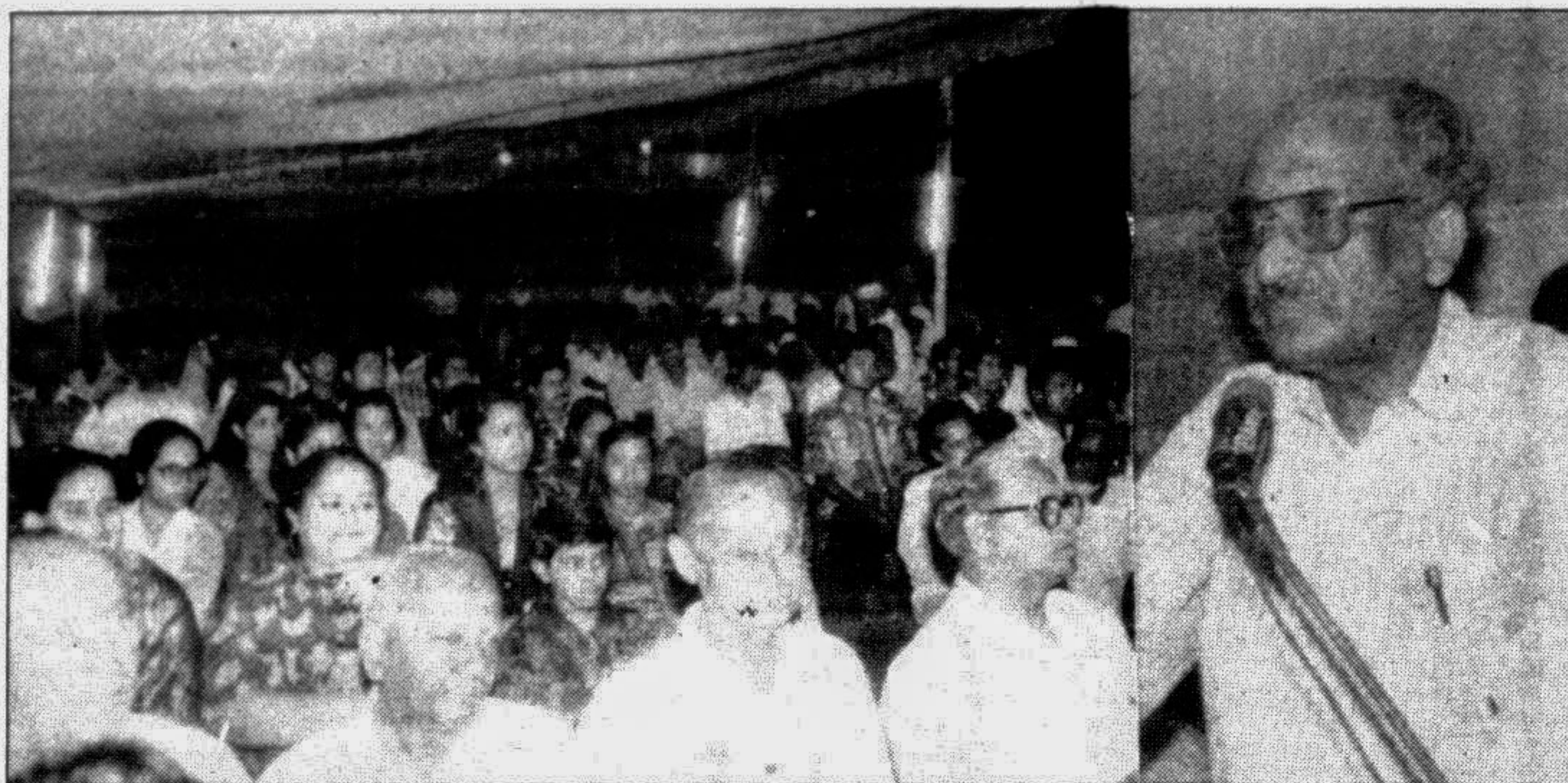
SYLHET: Finance Minister M Saifur Rahman speaking as chief guest at the foundation laying ceremony of local law college recently.

Earlier, the minister also addressed at a foundation laying ceremony of the newly building of Matamohori College at Lama.