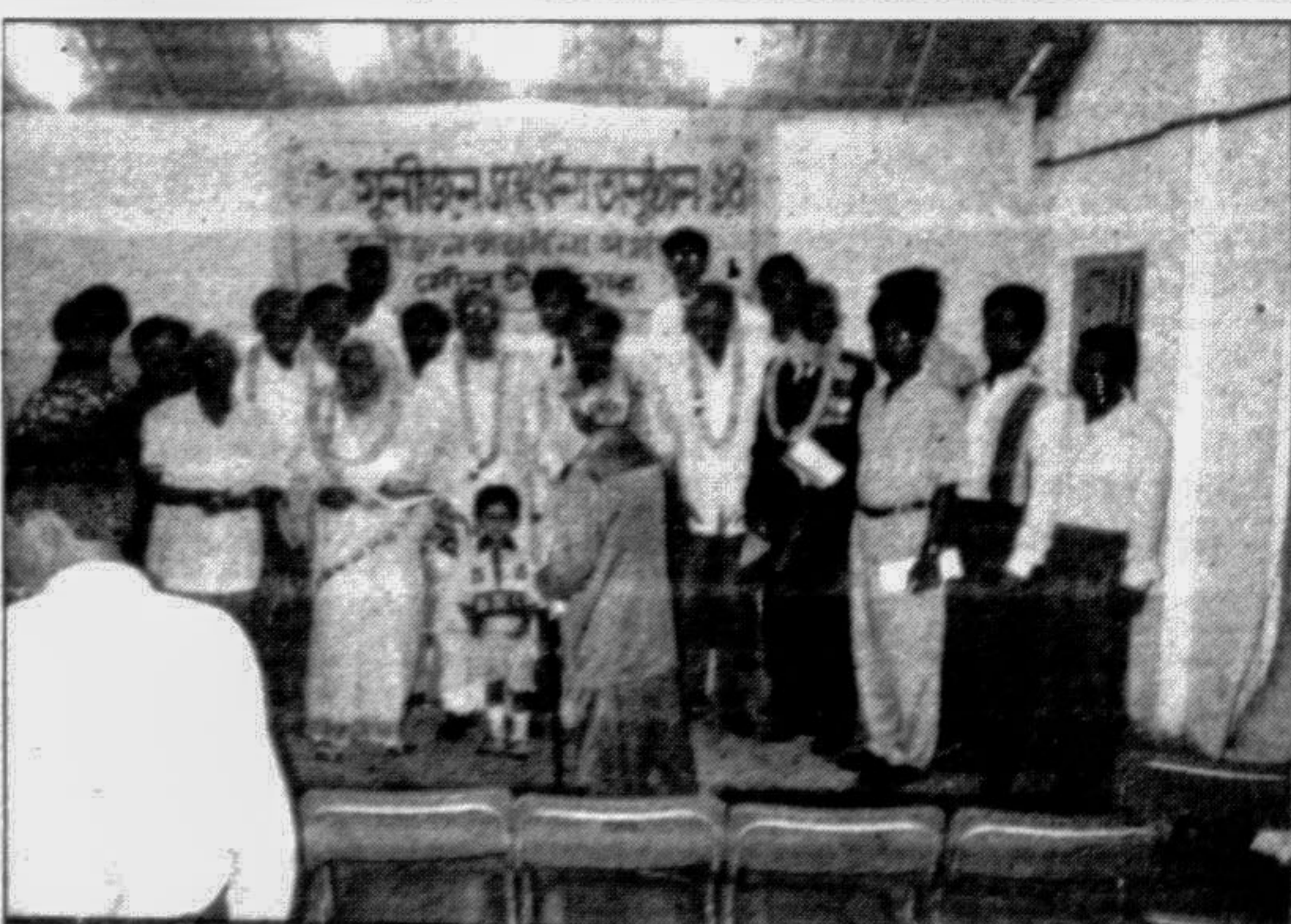
MAULVIBAZAR: The members of the local Gunijan Sambardhana Parishad with the personalities who received prizes for their outstanding performances.

The residents of the pourashava have urged the authorities to look into the matter and take necessary measures in this regard to ensure safety of the public health.