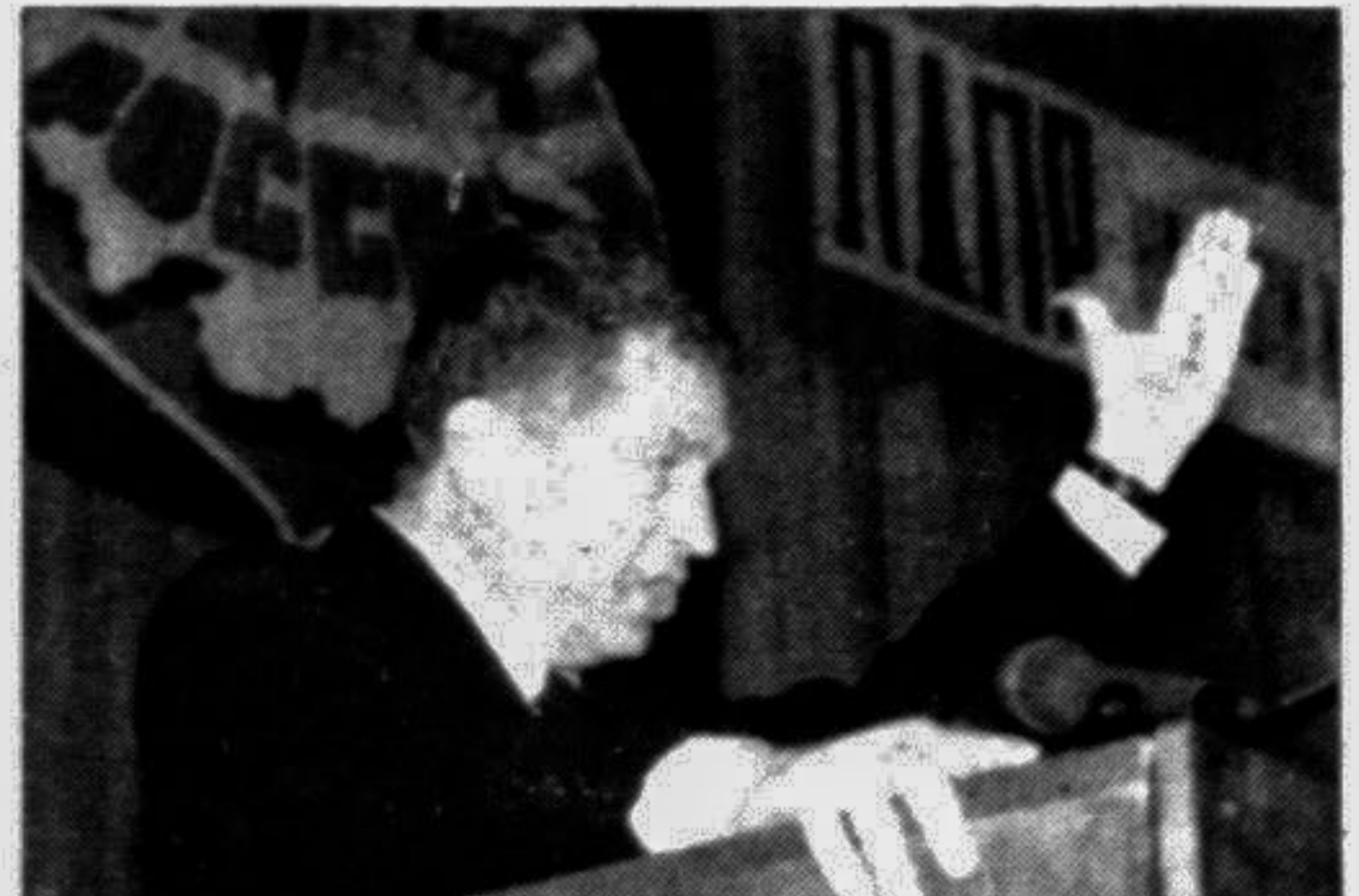
Vladimir Zhirinovskiy, leader of Russia's Liberal Democratic Party, gestures during his speech at the 5th congress of his party in Moscow yesterday. He urged the delegates to strengthen the party powers to boost his chances of winning the Russian presidency.

Vietnamese PM in Phnom Penh: Vietnamese Prime Minister Vo Van Kiet arrived in Phnom Penh yesterday for a 24-hour visit during which he is expected to discuss lingering problems over border demarcation and Vietnamese settlers, a Cambodian official said, Reuters reports from Phnom Penh. Among the Cambodian leaders welcoming Vo at Phnom Penh's airport were co-prime ministers Prince Norodom Ranariddh and Hun Sen as well as Foreign Minister Prince Norodom Sirivudh.