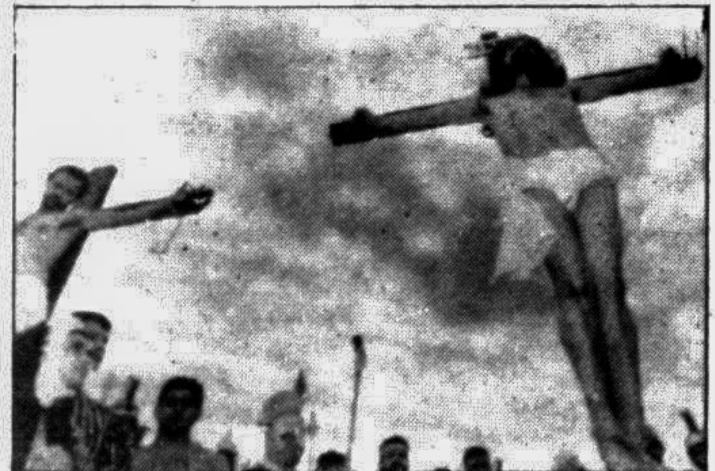
A man acting as Jesus of Nazareth reenacts the crucifixion on Friday in the city of Pese, 160 miles outside of Panama City. Thousands of Panamanians take part in different religious rituals that last until Easter Sunday, today.

Cuba to cancel May Day parade: Cuba will cancel its May Day parade this year for the first time since Fidel Castro took power in 1959 because of its economic crisis, news reports said Friday. AP reports from Mexico City. The government cannot afford to pay for the Labour Day festivities, a spokesman for the Cuban Workers' Central, a powerful labour federation, told the Mexican news agency Notimex in Havana.