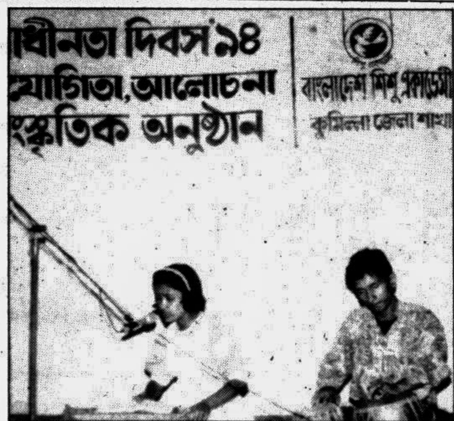
COMILLA: A child artiste is presenting a patriotic song at a function arranged on the occasion of Independence Day.