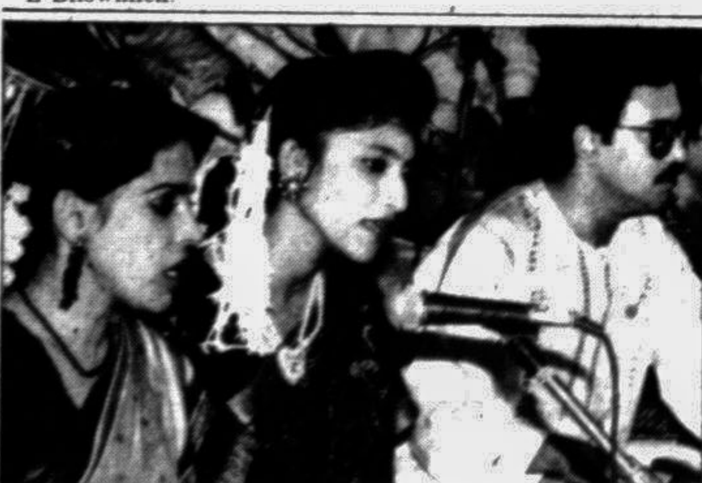
Artists of Baitalik performing Tagore songs at the auditorium of the Institution of Engineers yesterday.