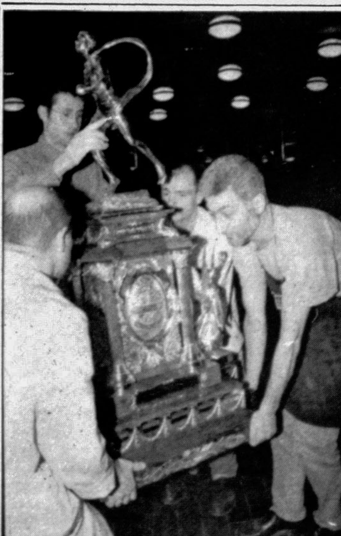
A new trophy, which will be presented to the winners of the London Marathon on April 17, is being brought out for display a press preview in London recently. The trophy was crafted in 1909 to symbolize the ethos and encouragement of marathon.

But he did not tip them for the title: "They lack experience... may be if they face Brazil, Italy, Holland and Germany it will be difficult for them."