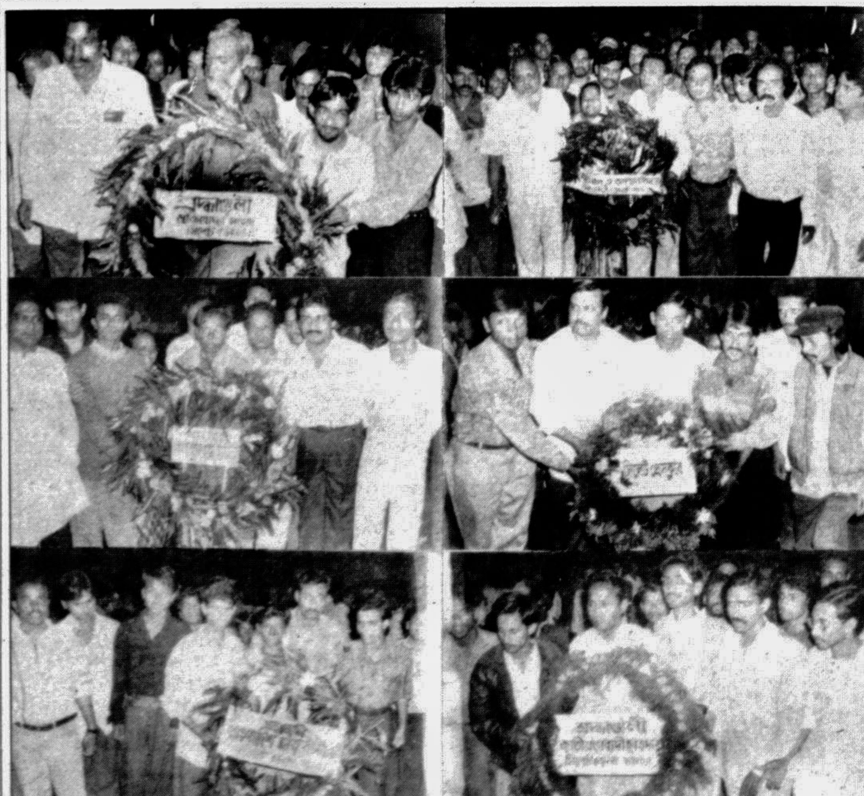
SYLHET: Members of different political parties and student organisations placing wreaths at local Smriti Saudha on the occasion of Independence and Solidarity Day.

Besides, hailstorm caused damage to wheat and onion in the district, sources said.