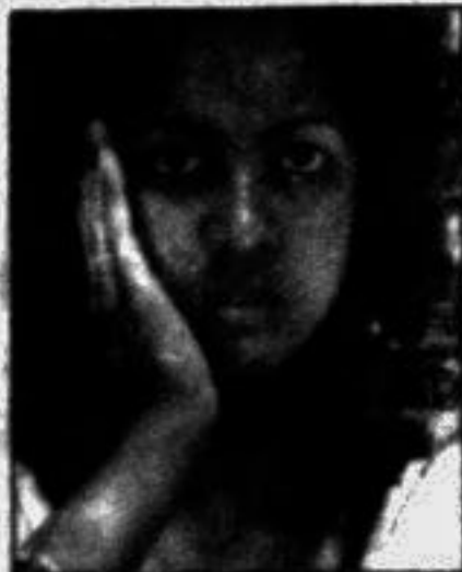
Focusing on the Complexity of Racism Page 3