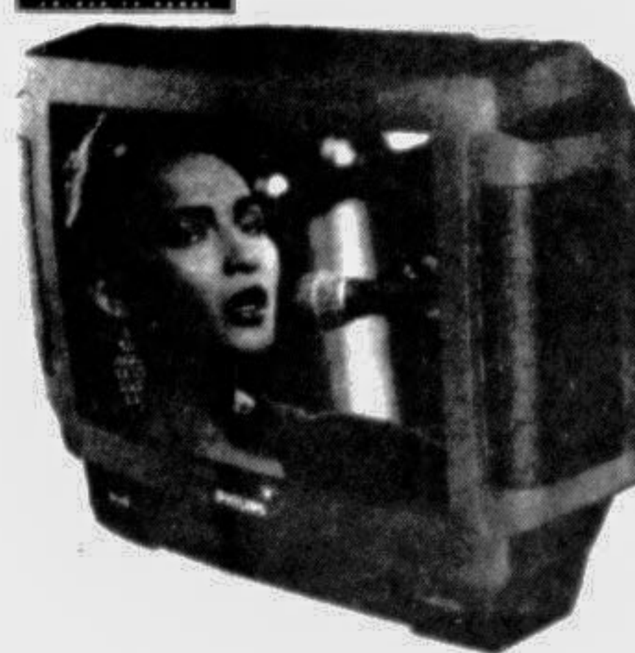
Powersvision CTV 21"