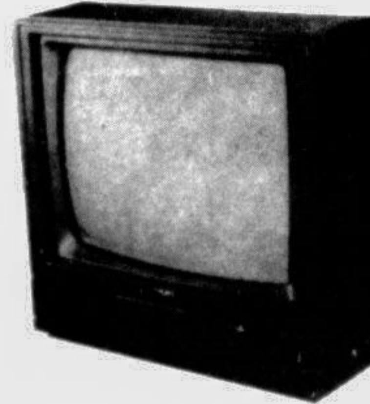
Philips B/W TV 17"