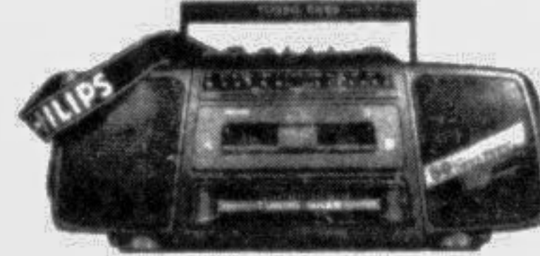
Turbo Stereo Recorder