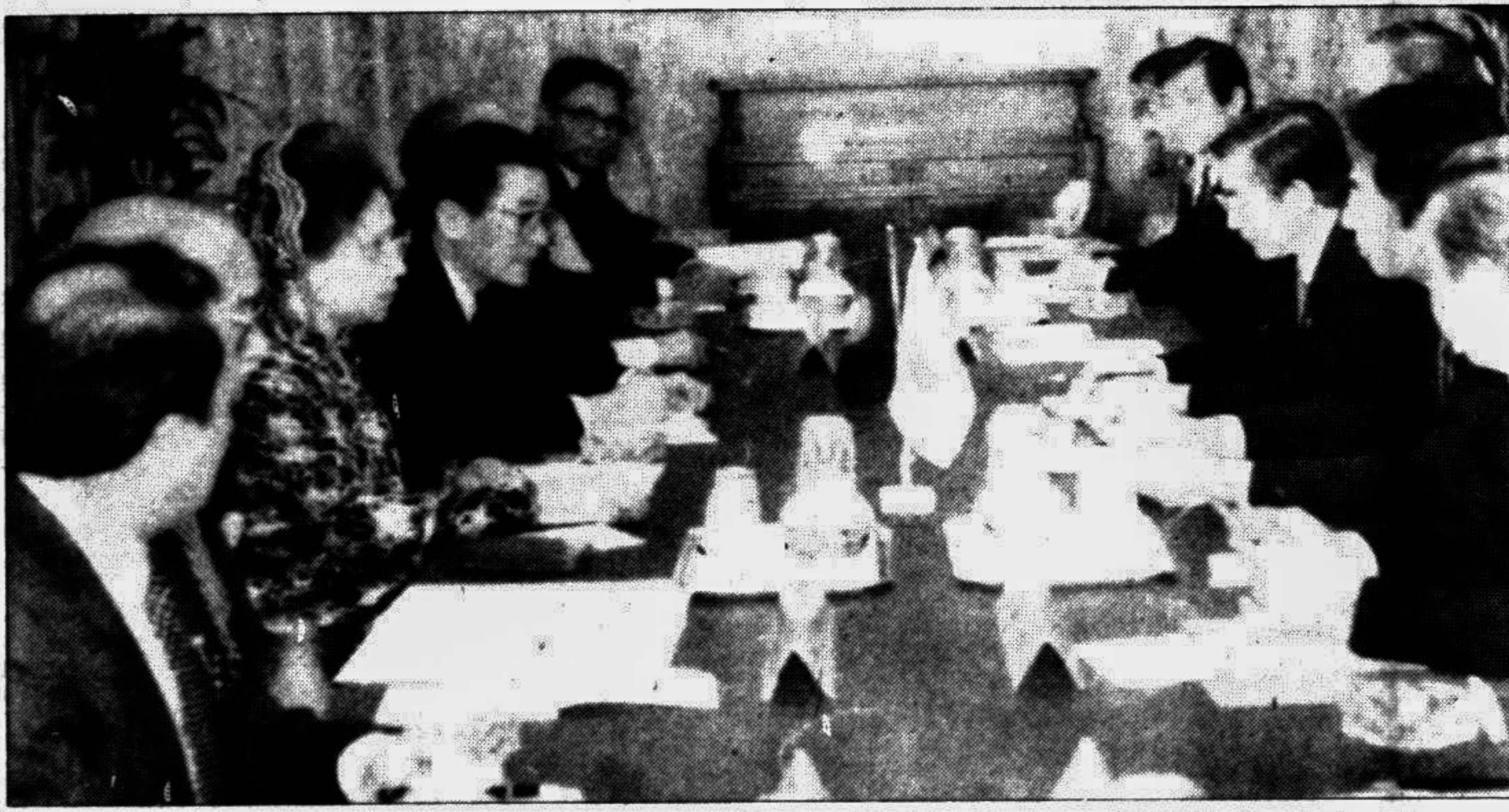
Prime Minister Begum Khaleda Zia and Japanese Prime Minister Morihiro Hosokawa (2nd R) leading their respective sides at the official talks held at the Japanese PM's residence in Tokyo yesterday.