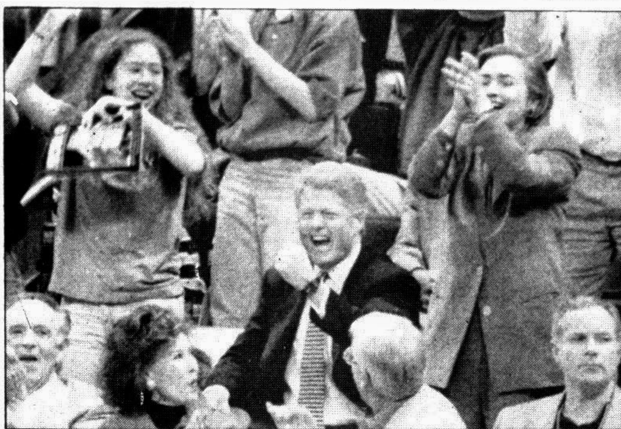
The Clintons cheer on the Arkansas Razorbacks basketball team during the first half of the Mideast regional play-off at Reunion Arena in Dallas on Sunday.

Colprensa said Valderrama would return to Barranquilla to train with the local junior team within the next 10 days.