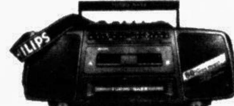
Turbo Stereo Recorder