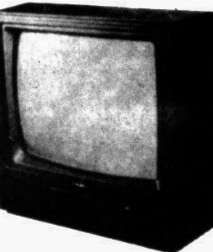
Philips B/W TV 17"