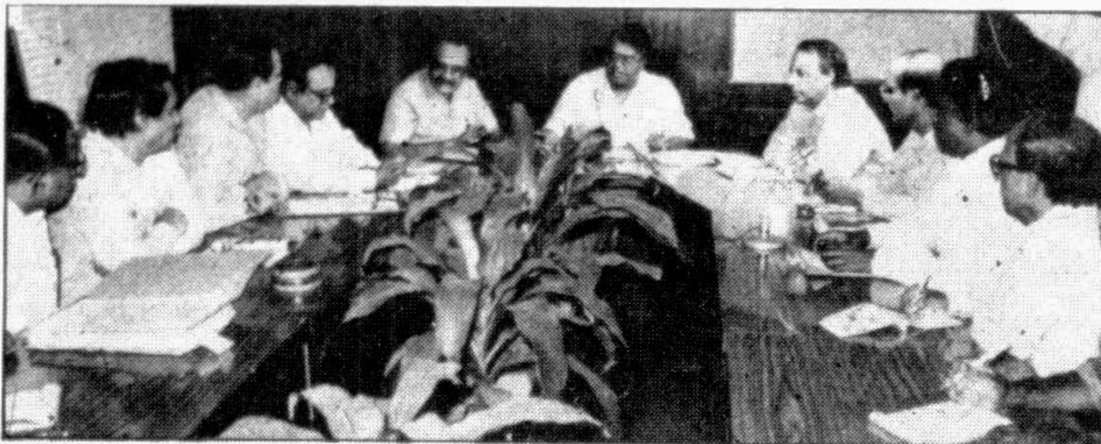
Information Minister Barrister Nazmul Huda presiding over a meeting concerning Asia Satellite and Cable TV network at the conference room of the Information Ministry in the city yesterday.

The Dhakaitte pauses to think, and then life goes on. As always.