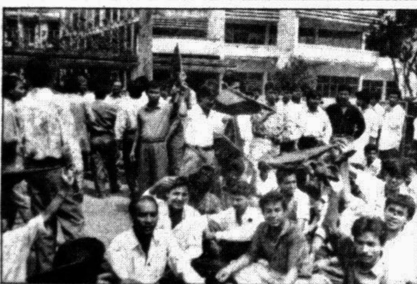
The Chhatra League (M-1) staged a sit-in in front of the MBA Bhaban with black flags yesterday.