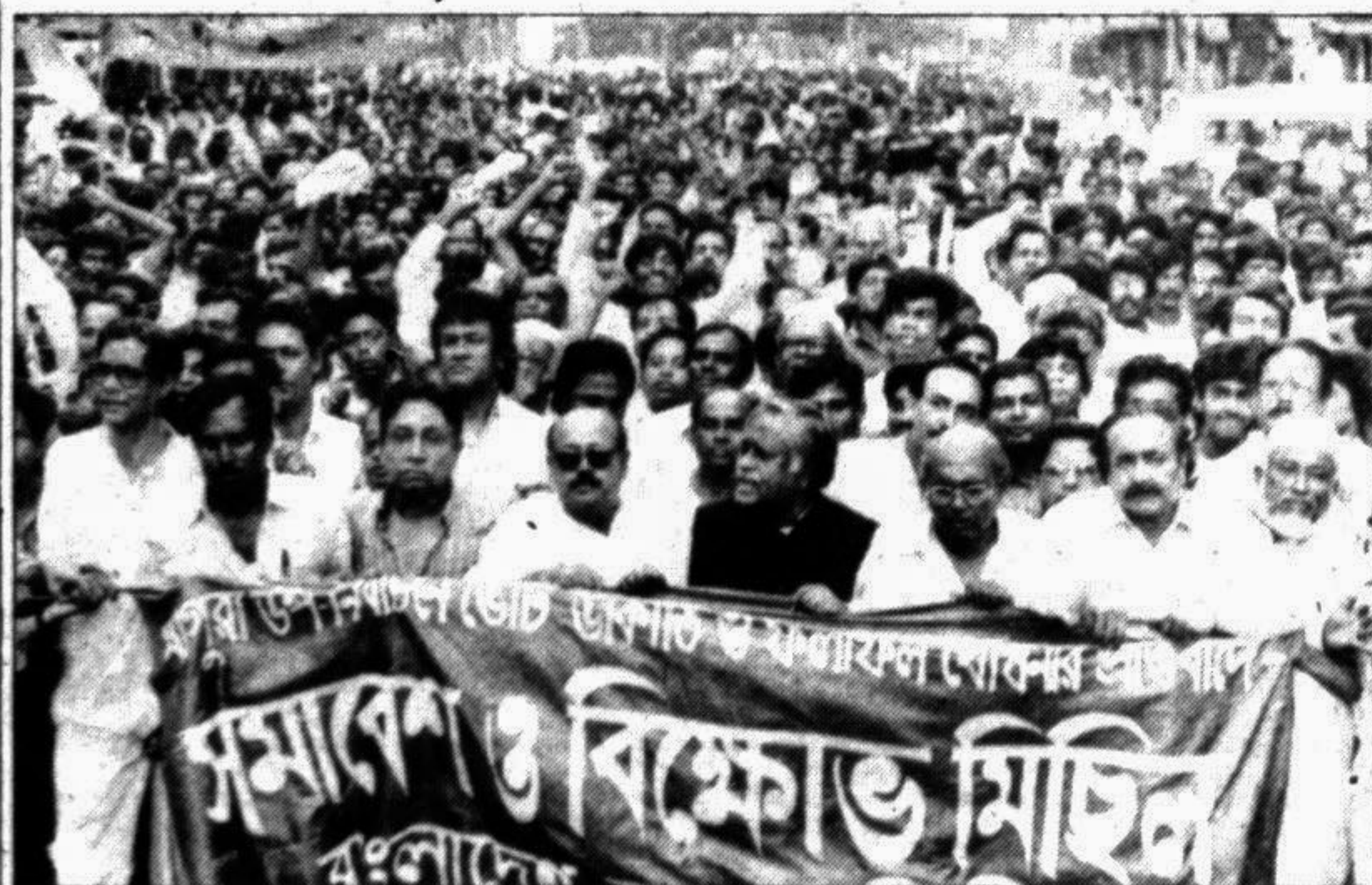
The Bangladesh Awami League brought out a procession in the city yesterday protesting alleged rigging and publication of the official results of the Magura-2 by-election.

Students of the BIT started boycotting classes from Sunday. Several BIT students alleged harassment by the stu- dents of the Khulna University in an incident occurring near the Dak Bungalow on March 24, involving the institute's trans- port