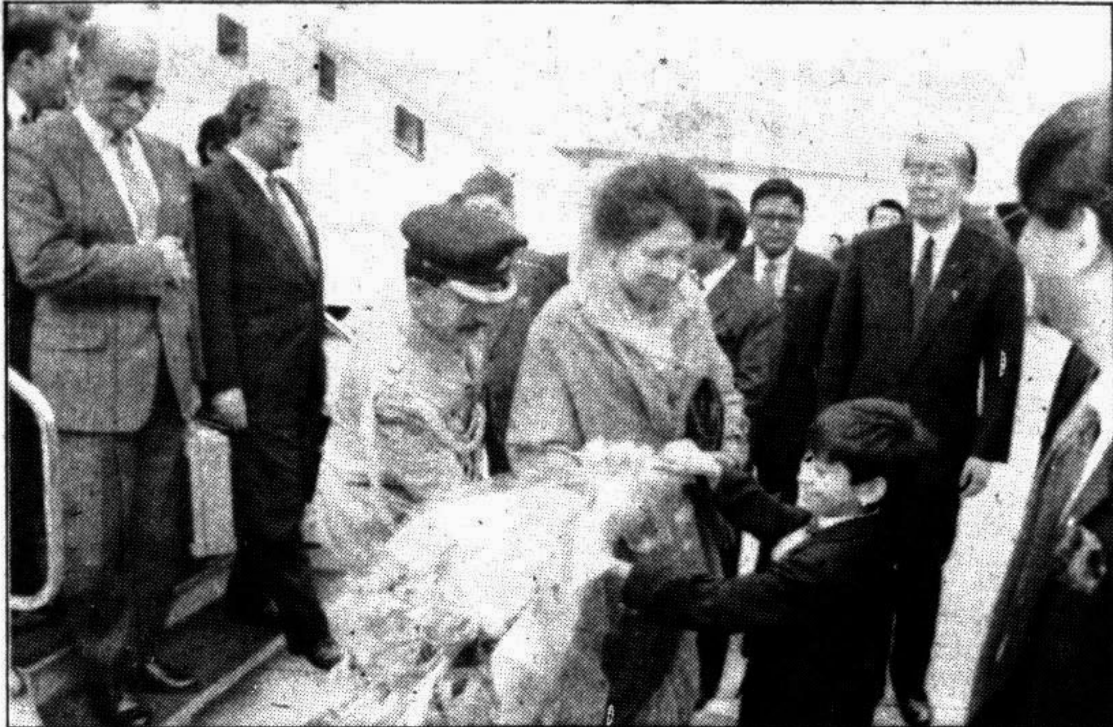
Prime Minister Begum Khaleda Zia being presented a bouquet by a small boy upon her arrival at the Narita Airport in Tokyo yesterday on a four-day state visit. With the Prime Minister are Foreign Minister Mostafizur Rahman (L) and Finance Minister Saifur Rahman (2nd L).

She said, "unprecedented rigging" in Magura-2 by-elec- tion proved that polls under the present government would never be free and impartial. See Page 12 Col 8