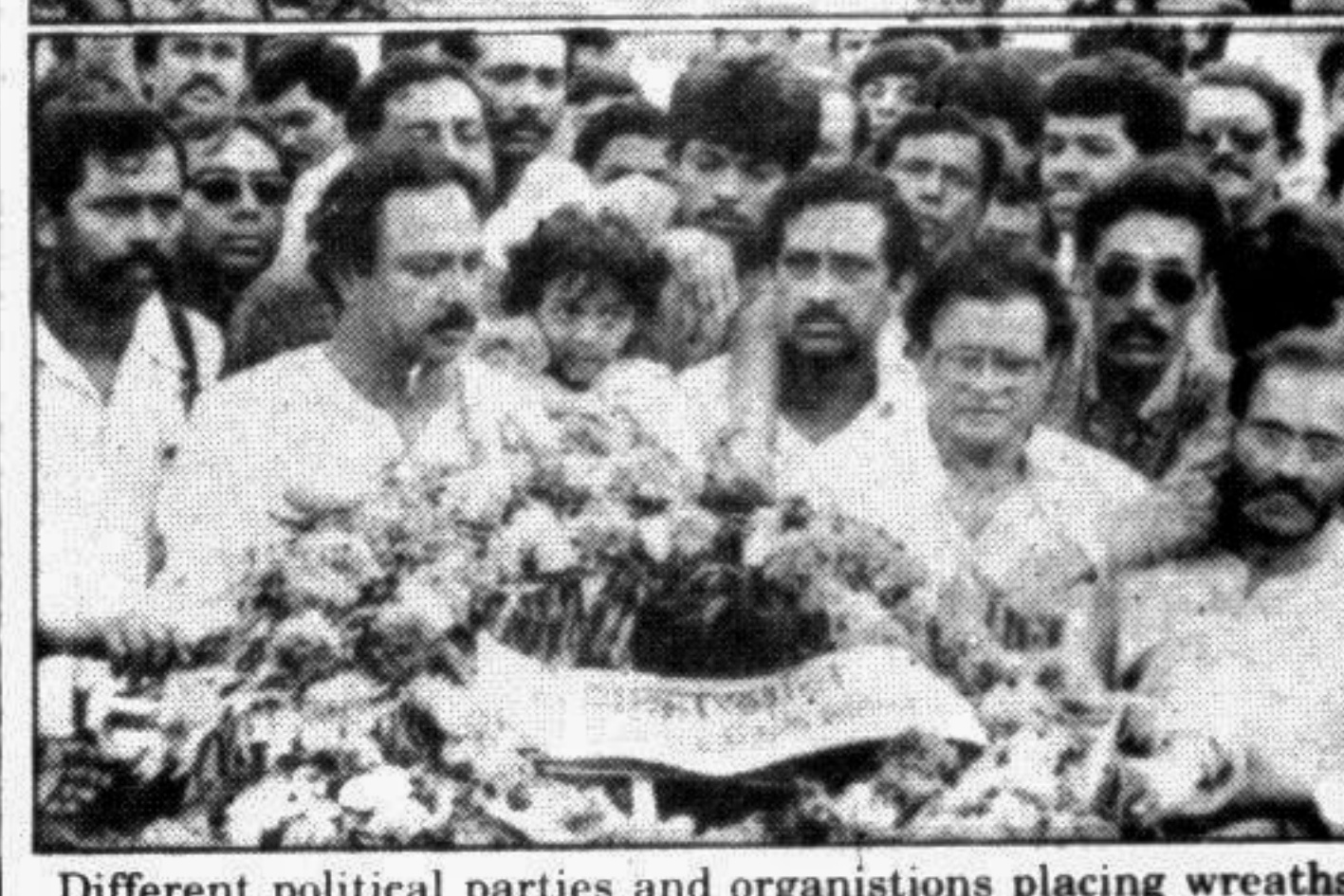
Different political parties and organisations placing wreaths at the Savar National Memorial Saturday. From top: 1) DUCSU leaders, 2) The Supreme Court Bar Association, 3) The Nirmul Jatiya Samannay Committee, 4) The 8-party left alliance, 5) JSD (Rab).