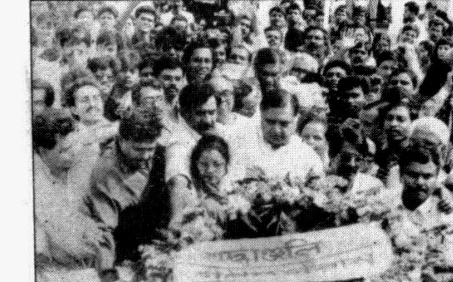
Different political parties and organisations placing wreaths at the Savar National Memorial Saturday. From top: 1) The Liberation War Sector Commanders, 2) War-wounded freedom fighters, 3) Projanma — '71, 4) The Gano Forum.