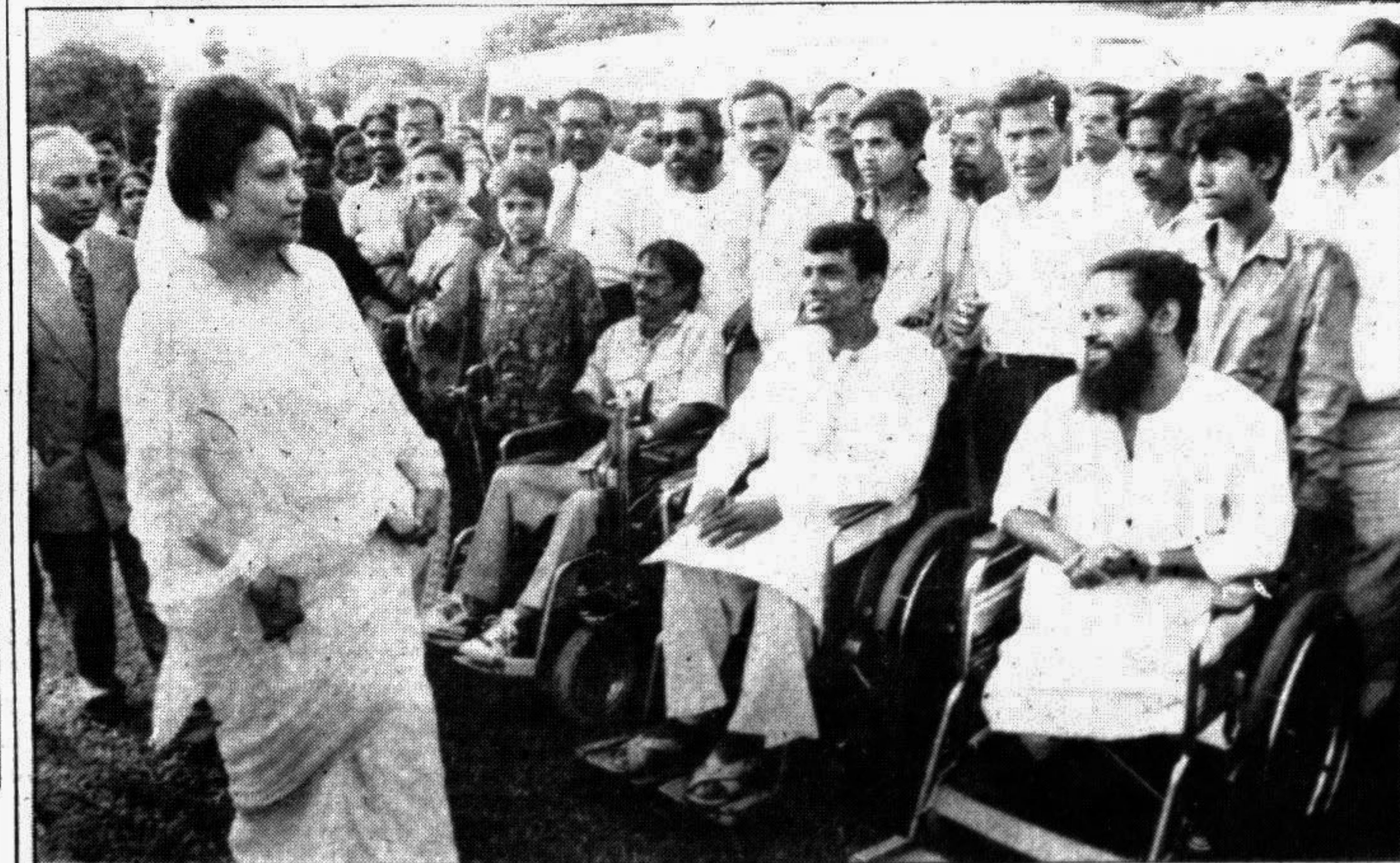
Prime Minister Begum Khaleda Zia exchanging greetings with the war-wounded freedom fighters at a reception hosted by President Abdur Rahman Biswas at the Bangabhaban Saturday.