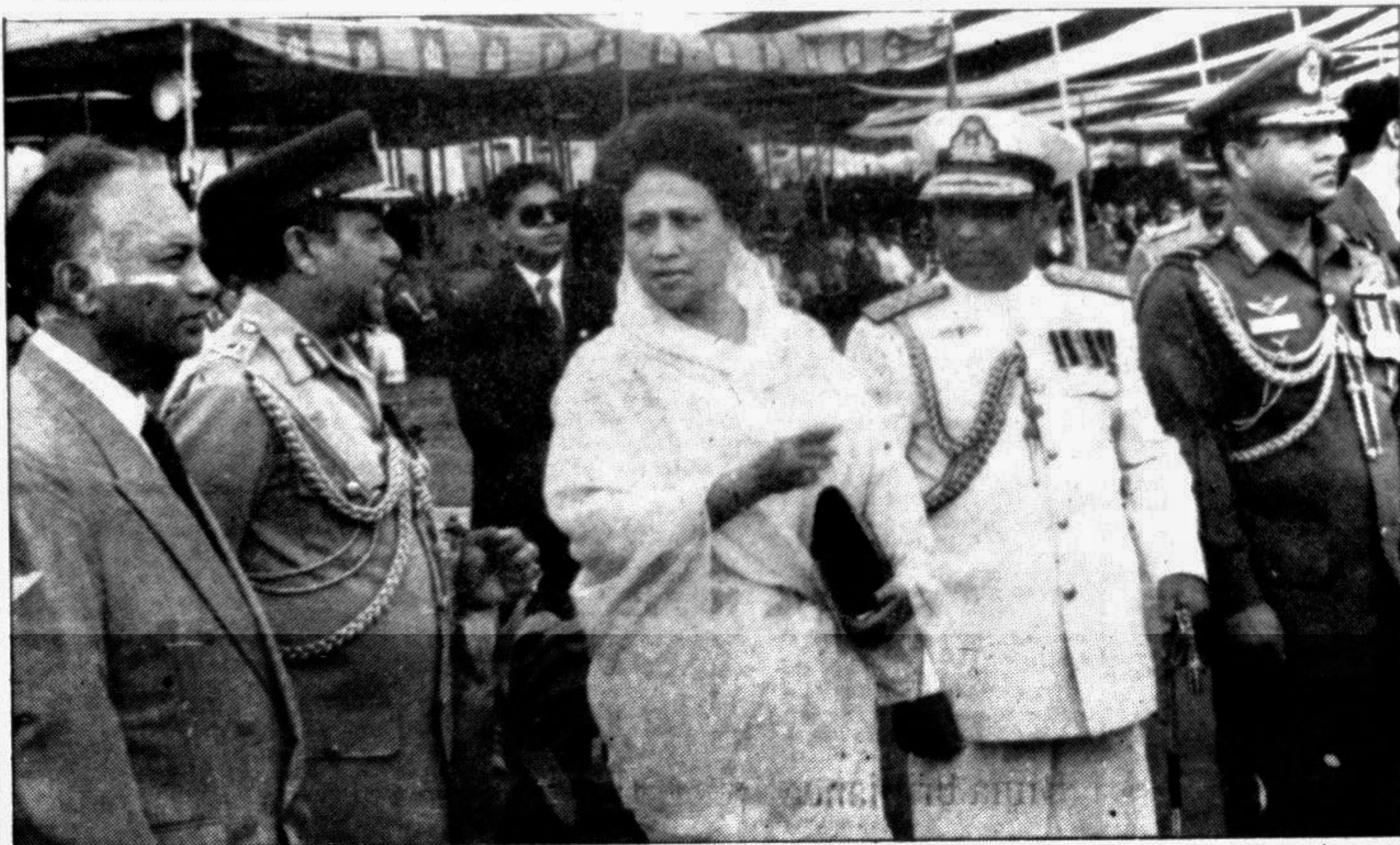
Prime Minister Begum Khaleda Zia, flanked by the chiefs of the three services, making a point during the Independence and National Day parade in the city Saturday.