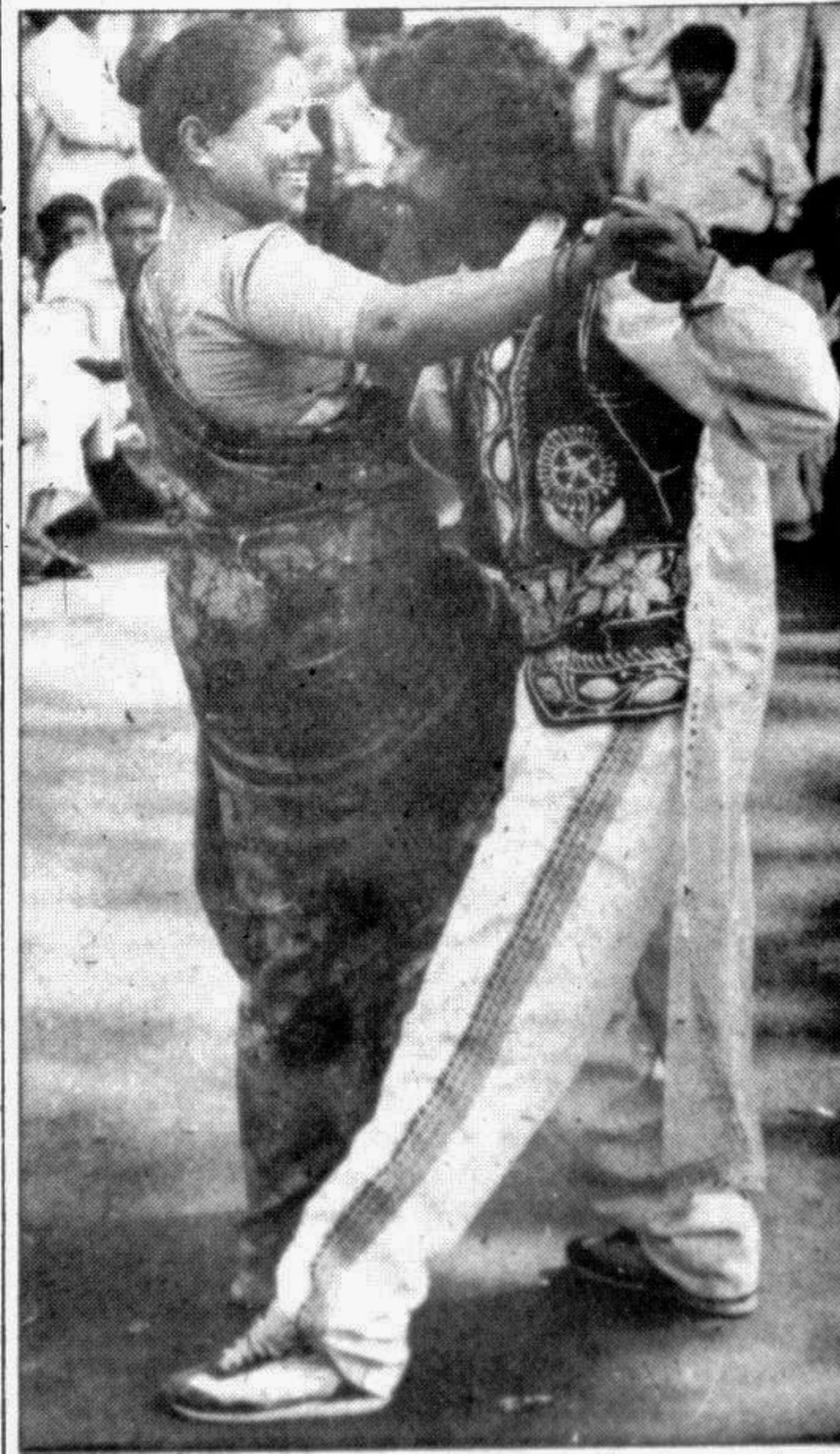
Part of the Independence Day festivity in the city — a street Jatra.