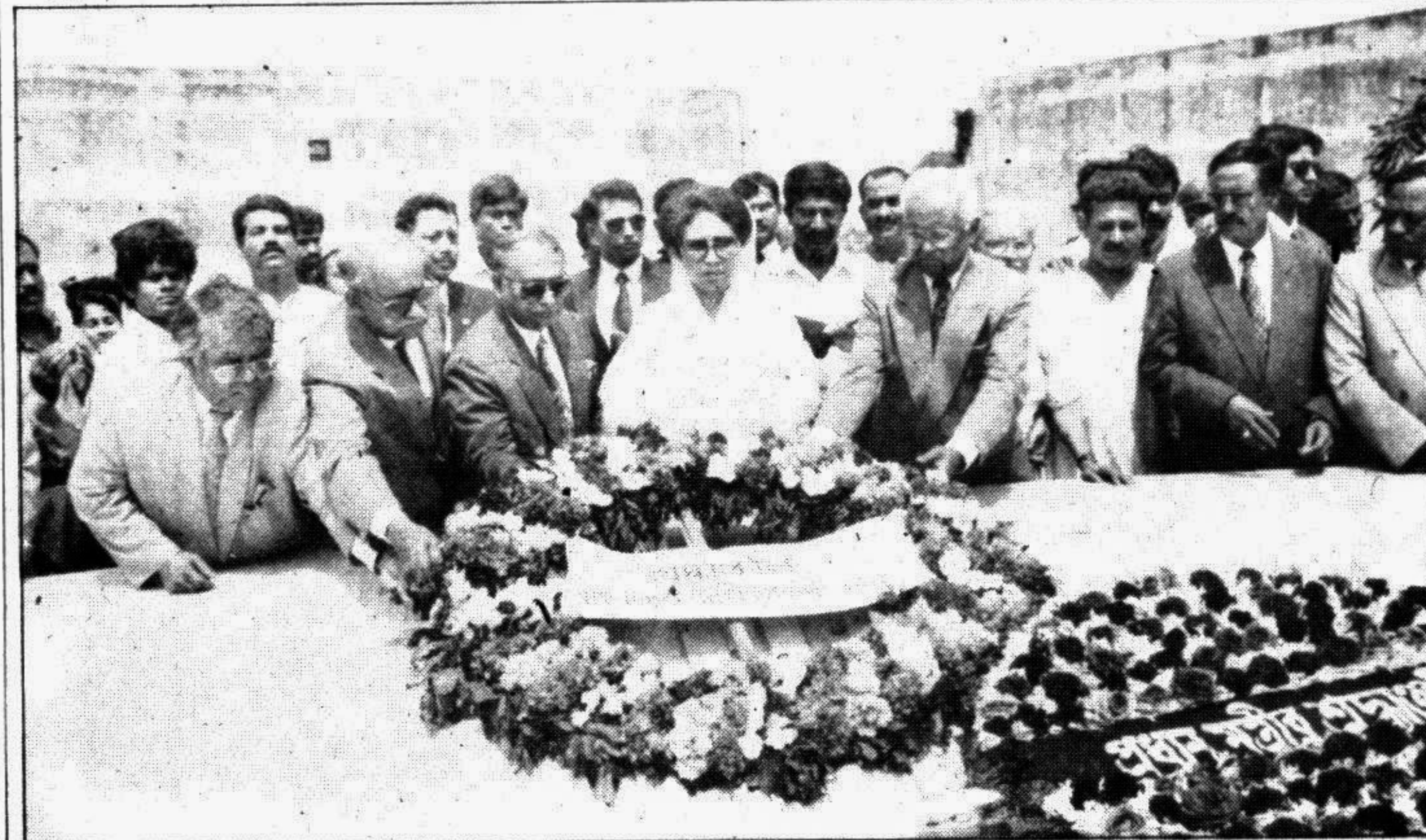
BNP chairperson and Prime Minister Begum Khaleda Zia placing wreaths at the mazar of late President Ziaur Rahman at Sher-e-Bangla Nagar in the city Saturday.