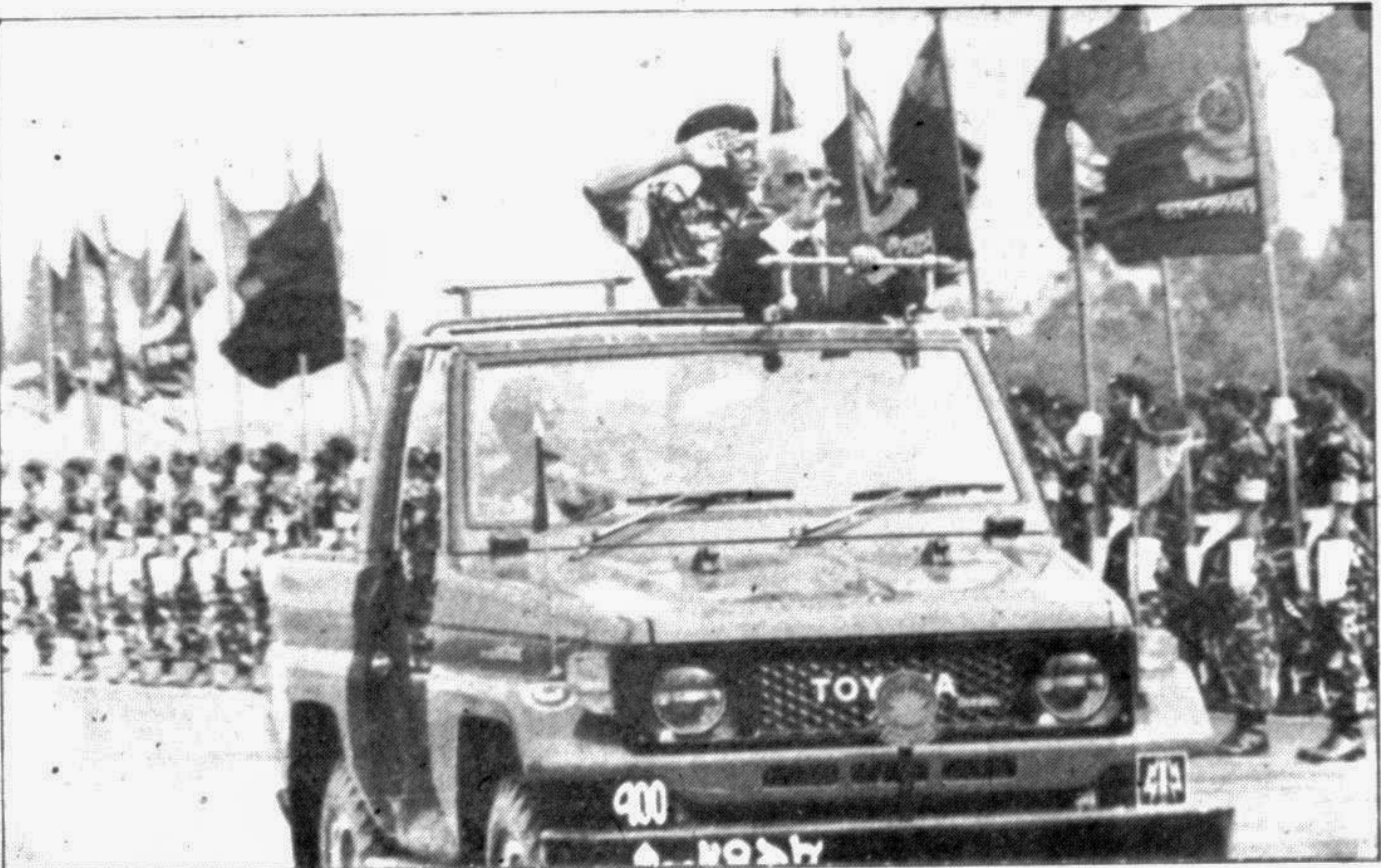
President Abdur Rahman Biswas inspecting the Independence Day parade Saturday.