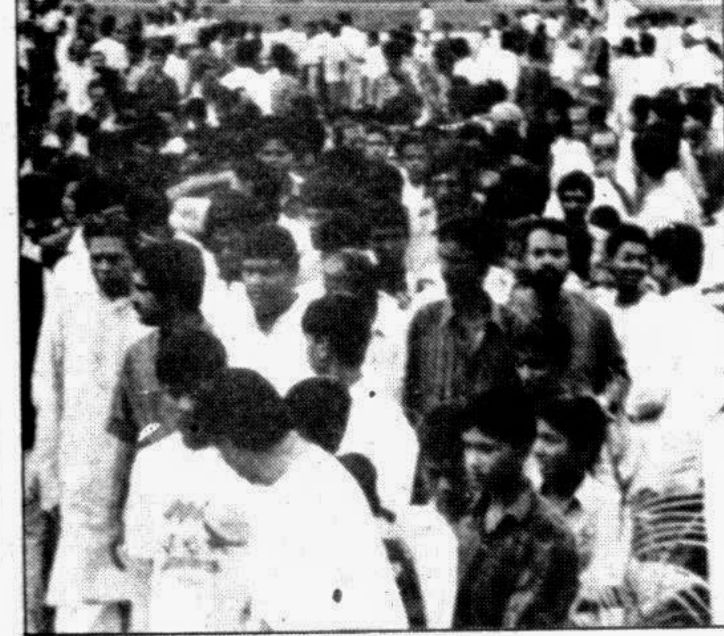
People from all walks of life went to the National Memorial at Savar Saturday to pay homage to the martyrs who laid down their lives for the independence of the country.