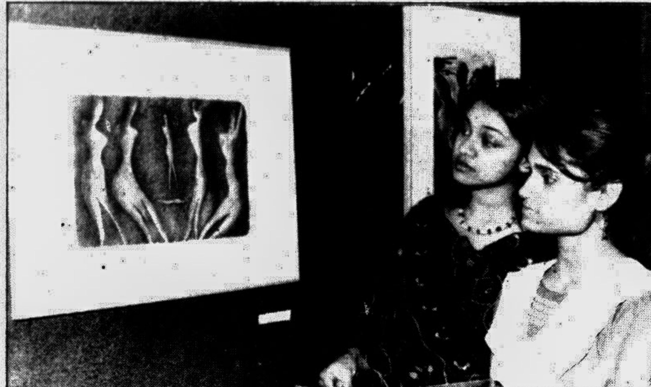
Gallery goes looking at an art work by Laila Sharmeen at the Galerie de L'Alliance Francaise at Dhanmondi in the city. Laila's fortnight-long solo maiden exhibition of prints and mixed media opened yesterday. The show will run from 3:30 pm to 8 pm until April 7.