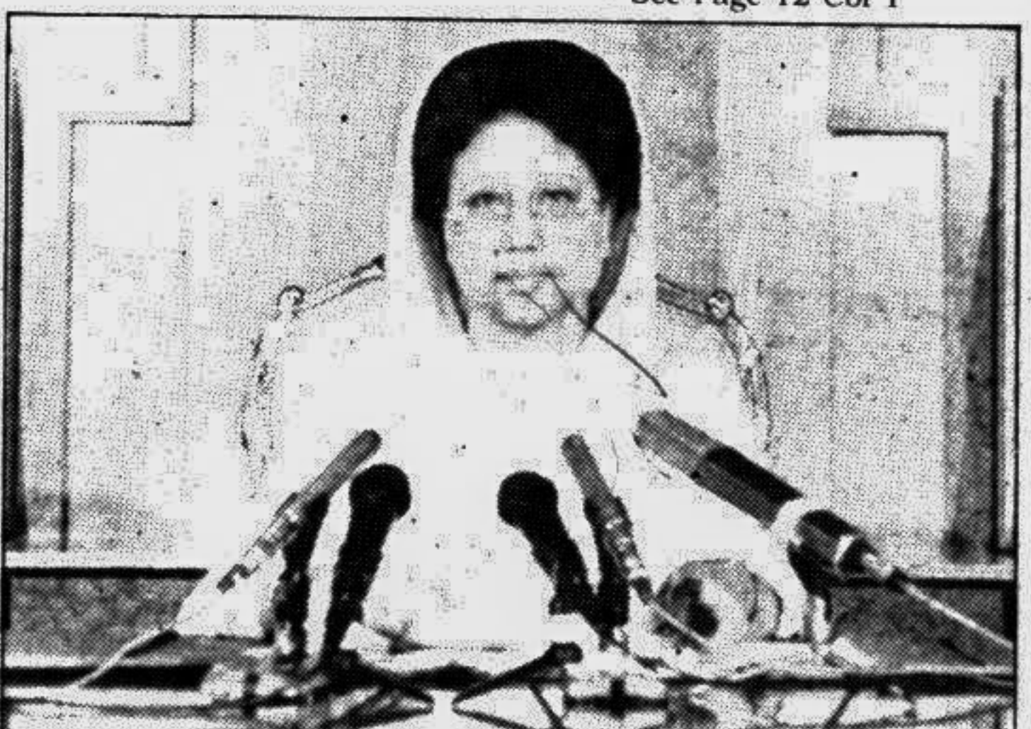
Prime Minister Begum Khaleda Zia yesterday addressing the nation on the eve of today's National and Independence Day.

Prime Minister Begum Khaleda Zia yesterday expressed her firm determination to carry forward people-based politics, development trend and the people's creative endeavours already initiated for building a happy homeland for the country's future generation, reports BSS. The dreams of the Liberation War — democracy, people's creativity, administrative transparency and accountability — are being realised, she said in an address to the nation over radio and television. "It would not be possible for anyone in future to deter the path of the people's own creative endeavours that we have opened," the Prime Minister said. With a note of determination Begum Zia said, "The path of the restoration of democracy might be difficult, but it is irresistible." The Prime Minister said her government, which has shouldered the responsibility of rejuvenating a ravaged economy, reviving the social values and establishing democracy and people's rights — has fulfilled many of the people's cherished aspirations within this short period. In her 30-minute address, she touched on many subjects including democracy, freedom of the press, market economy, social justice, export earnings, education, employment, agriculture, population control, industrialisation, foreign policy