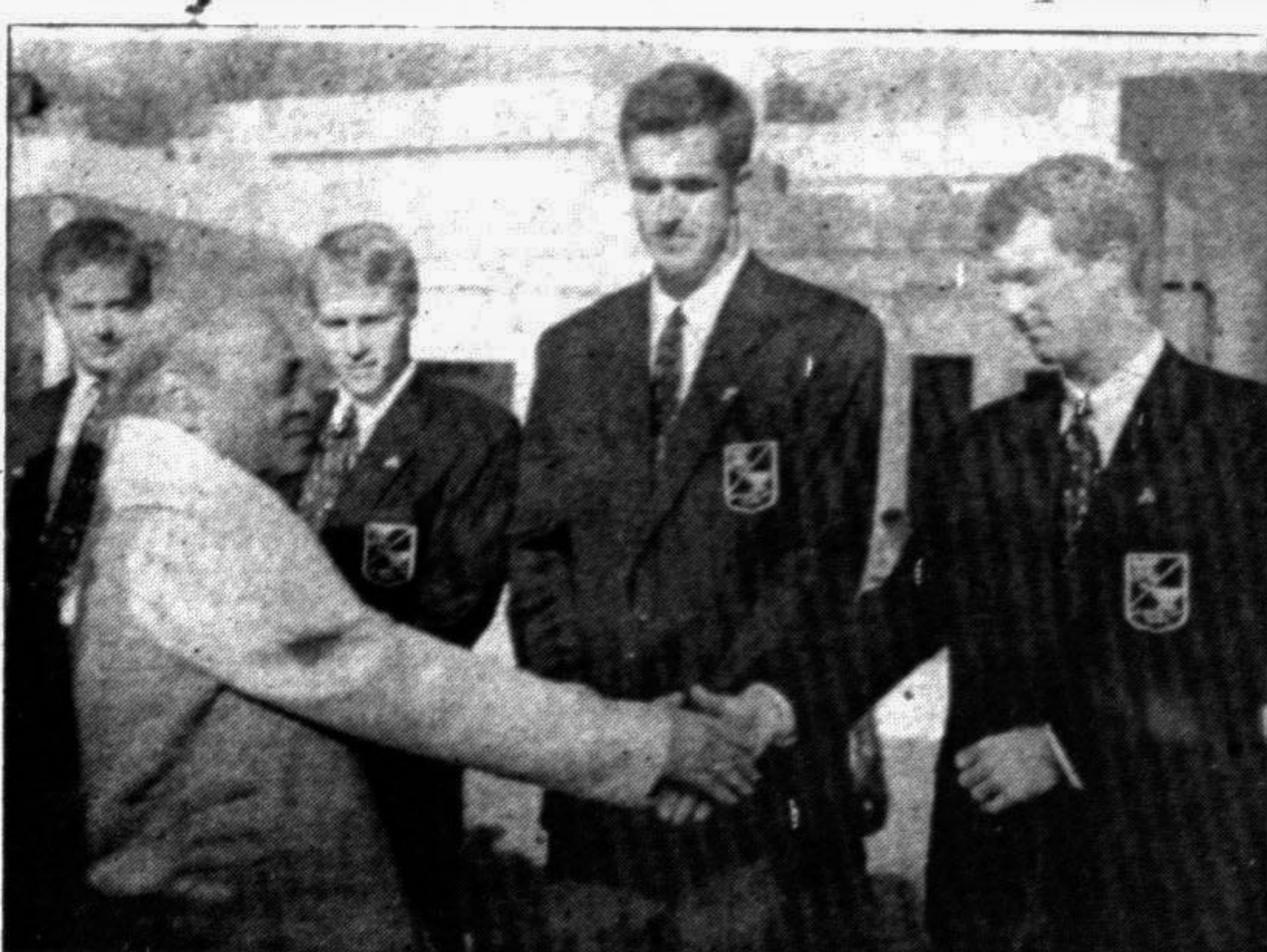
Two-time French Open champion Jim Courier (R) shakes hands with Indian Prime Minister P.V. Narasimha Rao at his residence in New Delhi yesterday. From left are: Patrick McEnroe, Richey Reneberg, Todd Martin and Courier.