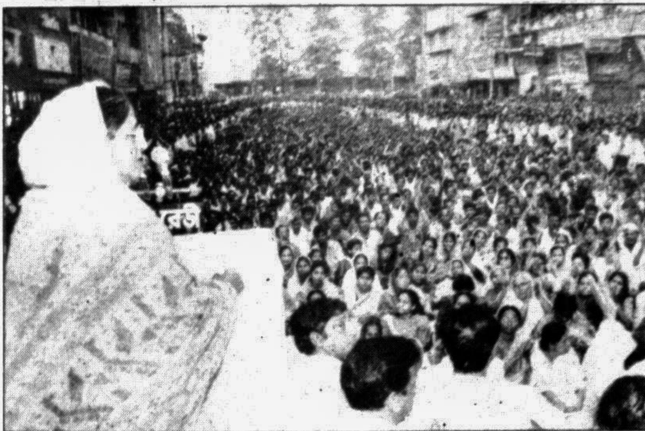
Awami League chief and Leader of the Opposition in Parliament Sheikh Hasina addressing a post-hartal public meeting at the Bangabandhu Avenue in the city yesterday.

After the speech, the Chief of the Naval Staff presented a missile craft model to the Prime Minister.