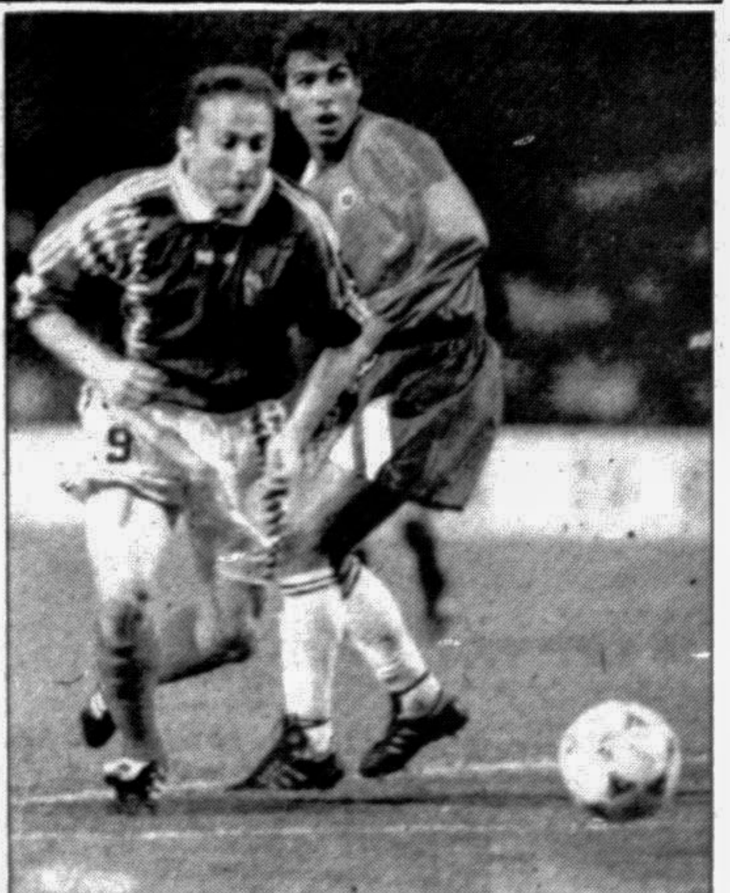
Frenchman Jean Pierre Papin runs the guard, Chile's Fuenfuentes in a friendly soccer match in Lyon on Tuesday. France won the match 3-1.

Magic may return as Lakers' coach LOS ANGELES, Mar. 23: Earvin "Magic" Johnson, who retired from professional basketball in 1991 after testing positive for the virus that causes AIDS, is returning to coach the Los Angeles Lakers, according to broadcast news reports, reports Reuters. Los Angeles television station KCAL and radio station KMPC reported on Tuesday that Johnson was being named to replace Laker coach Randy Pfund.