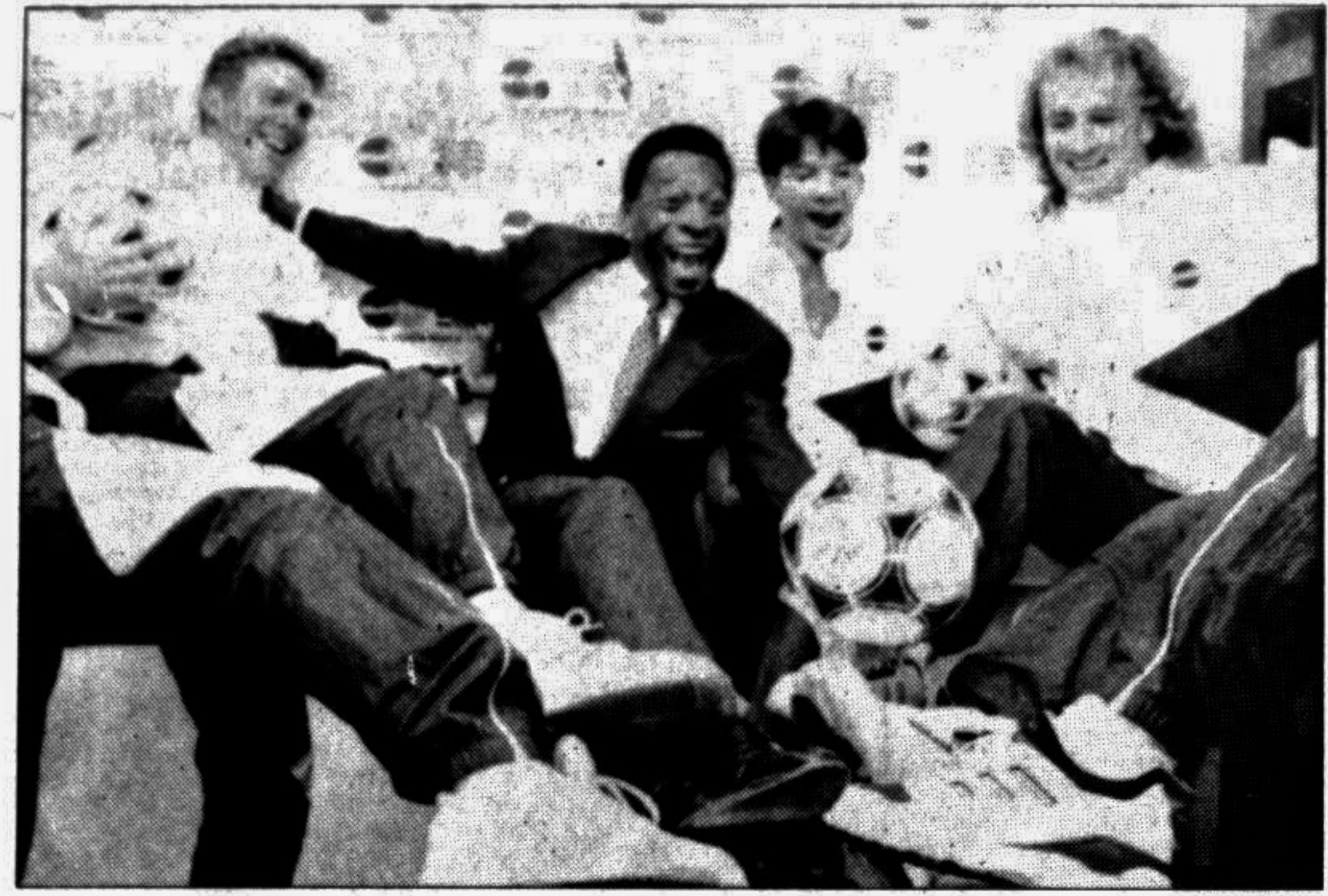
Brazilian soccer legend Pele kicks the ball around with members of the US national team during a promotional meeting in New York on Tuesday.