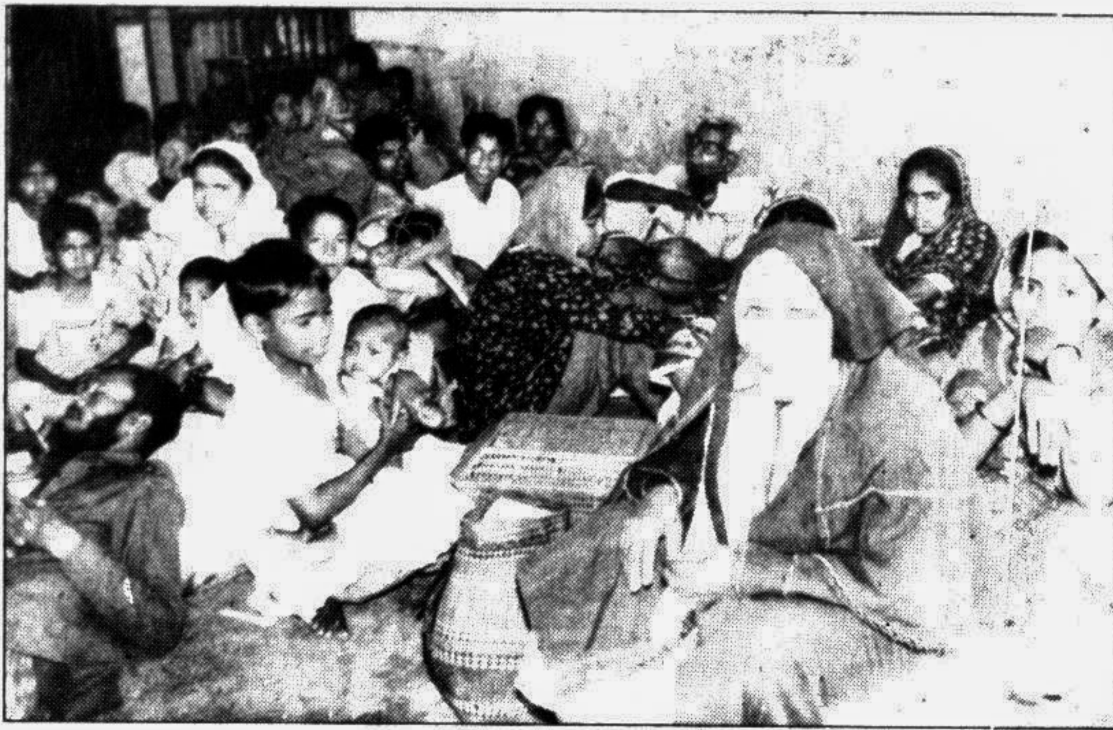
The stranded launch passengers at city's Sadarghat Launch Terminal during 6-hour hartal yesterday.