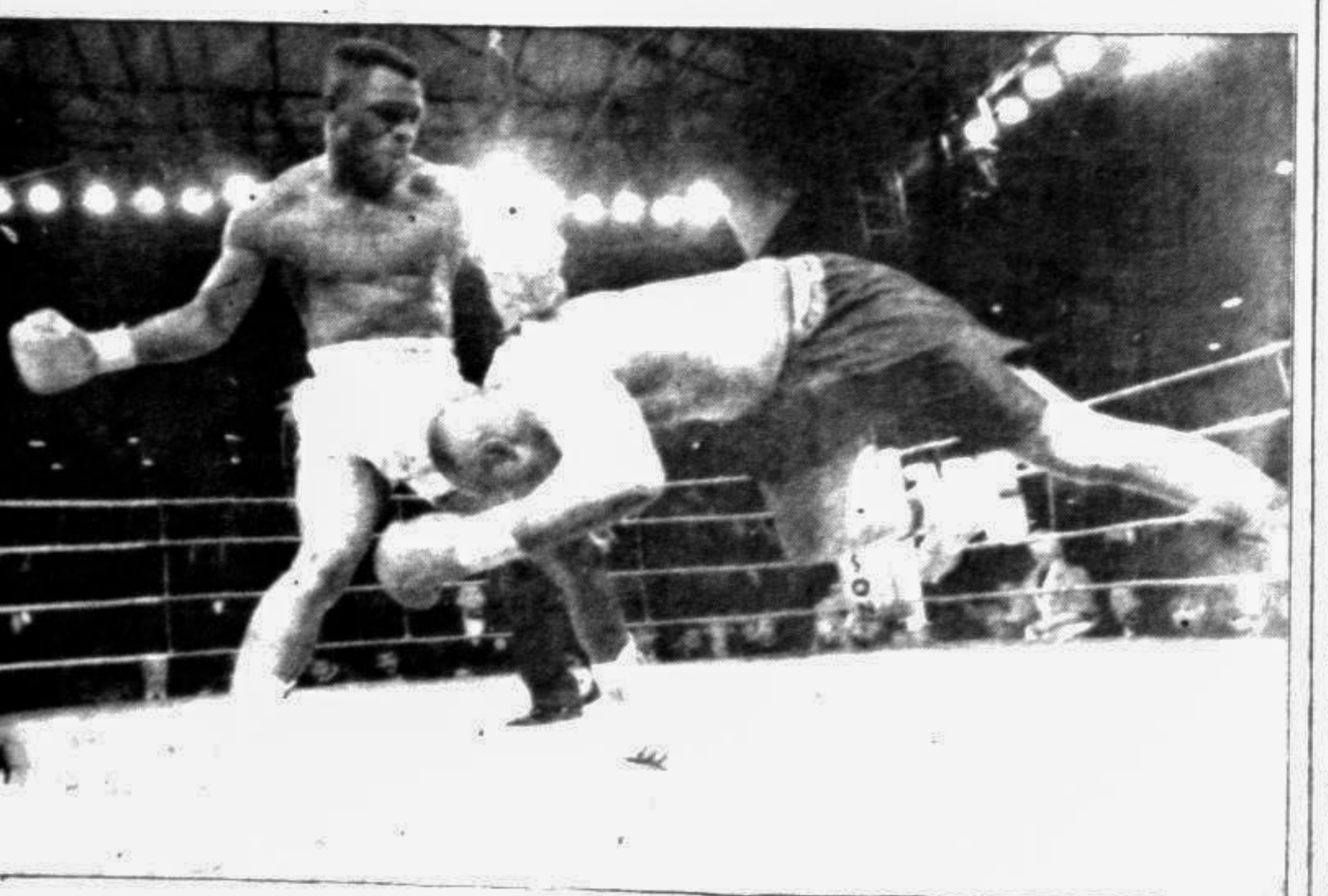
British challenger Herbie Hide sends American champion Michael Bentt crashing to the canvas in their WBO heavyweight title bout in London on March 19.