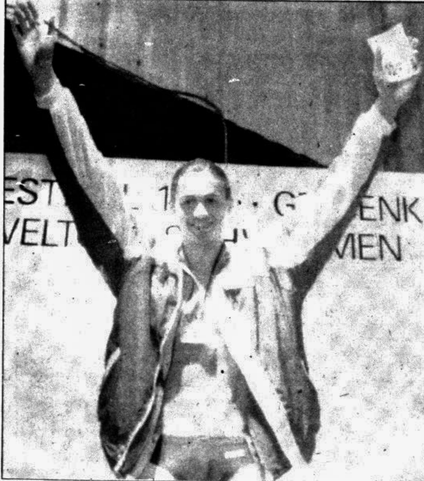
Russia's Alexander Popov is elated on becoming the first swimmer to break the 47 second barrier in the 100m freestyle short course competition at the World Cup in Gelsenkirchen, Germany on March 19.

November 22, 1992, at the European sprint championships in Espoo, Finland. Germany's European long-course champion Le Jingyi shared the women's freestyle honours. Van Almsick took the 200 metres freestyle in one minute 56.32 seconds — not far outside the 1:55:84 world short-course mark she set in Beijing in January 1993 — with Le Well back in fifth place in 1:59.52. But Le, fastest in the world at the 50 and 100 distances, turned the tables in the 50 event and celebrated her 19th birthday with a win in 24.92 fifteen-year-old Van Almsick was second in 25.27. Gelsenkirchen is the fifth of seven venues in the World Cup series. Sheffield, England, is next and Paris stages the finale next weekend.