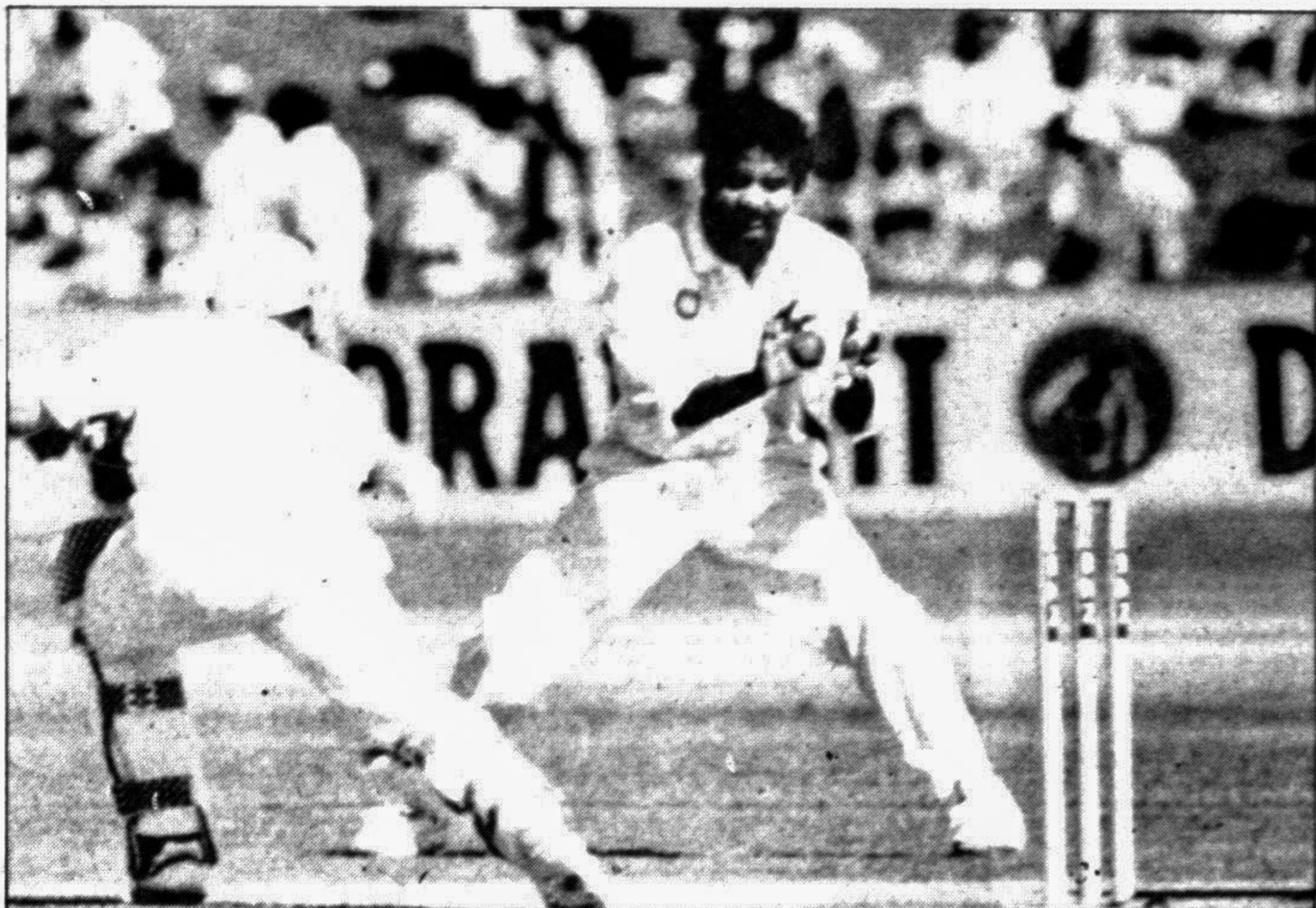
NO JOY: Indian skipper Mohammad Azharuddin is about to gobble up a ball with the hopes of giving another blow to the waning Kiwi innings. But the offering had no bearing as the ball played by Dion Nash bounced off the ground. New Zealand were all out for 187 on the second day of the one-off Test against India at Auckland yesterday.

Forty players are taking part in this Swiss league meet with a total amount of Taka 60,000 up for grabs.