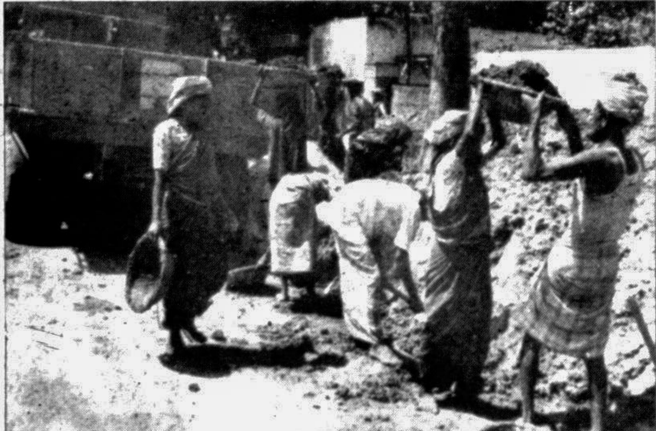
Women are no longer unequal to their male counterparts. These women are giving labour in an earthwork. This picture was taken yesterday.

A competent source confided to UNB that the Ganges registered a precipitous fall from 38,000 cusec last month to 17,500 cusec on March 16 this year. On the day last year the flow slid down to 11,000 cusec.