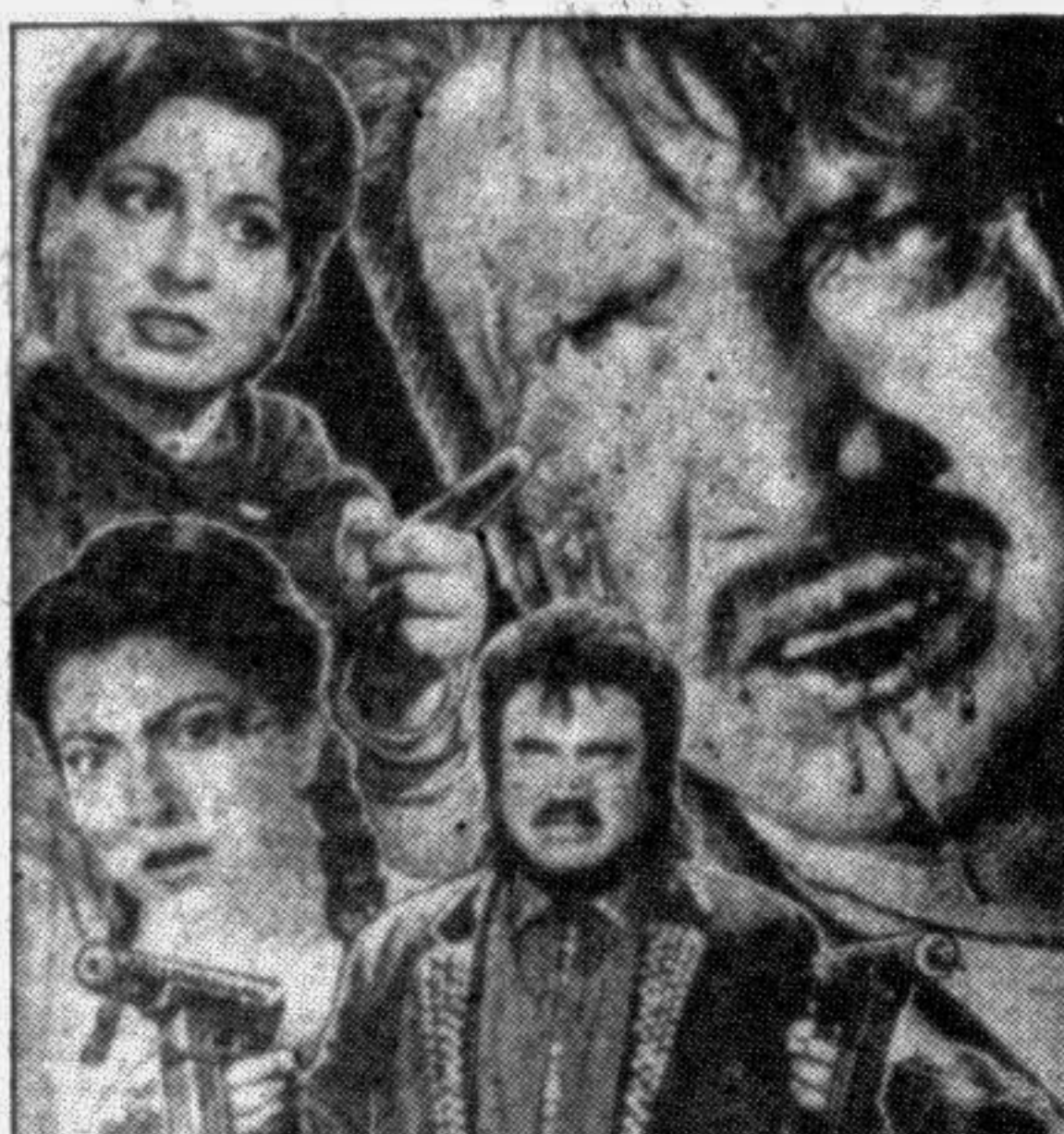
A world far from reality.

If this seems exaggerated, just sit through an episode of 'Chhaya Chhanda', a popular TV programme on film songs. This will show that the fatter the heroine the tighter her clothes. In one particular song a famous actress wears a white mini dress over purple exercise lycra pants and pink leg warmers and black leather boots. To accentuate her 36 inch waist line she wears a body clenching wide silver belt. In another song the same lady wears a balloon-like outfit in glaring gold with the same silver waist band. Wearing knee length white dresses with white net stockings to show jumbo thighs, white shoes and white lace gloves, (yes gloves), is also common attire to be worn on the set.