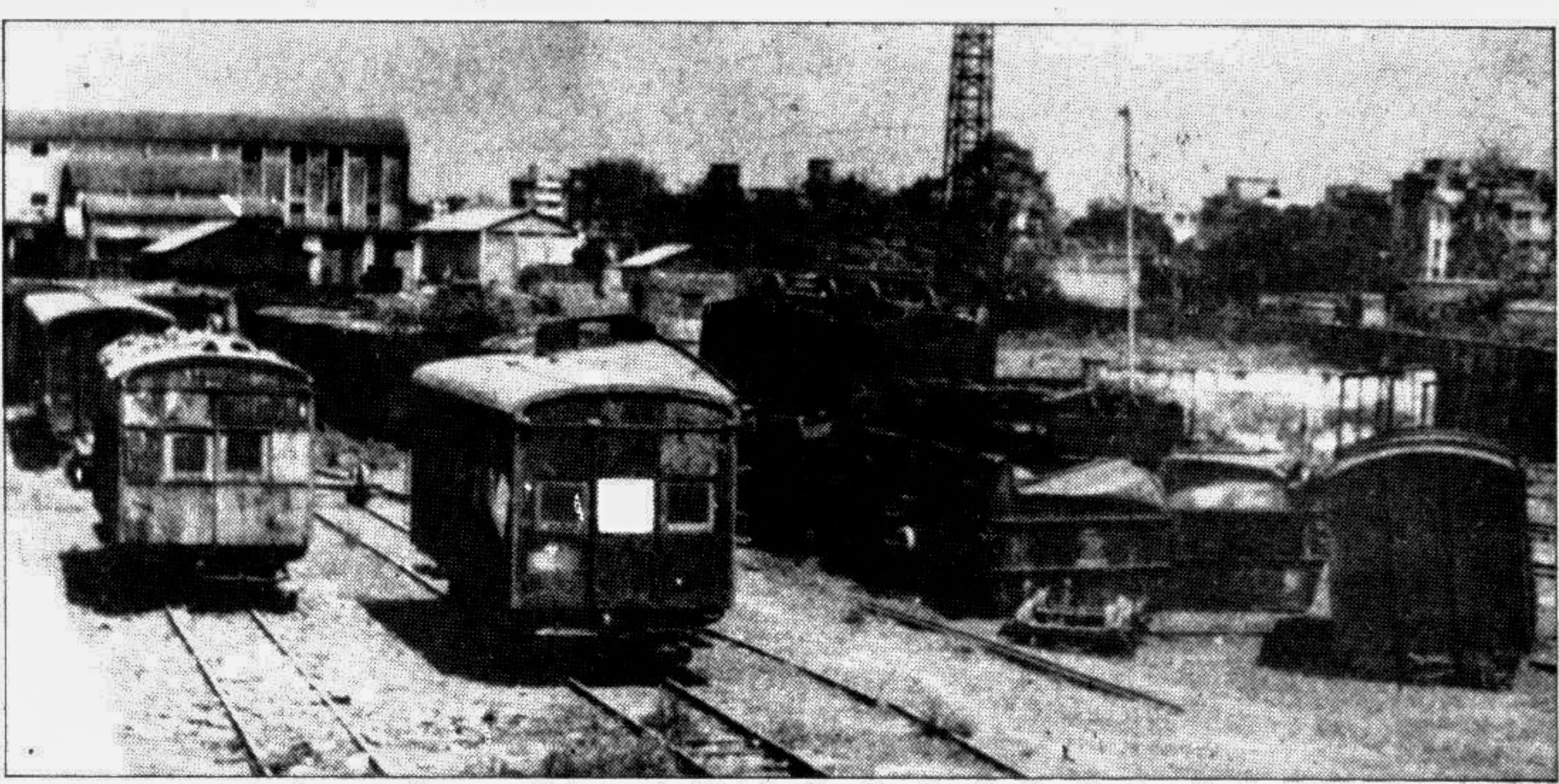
A good number of railway carriages worth crores of taka lying abandoned at the Kamalapur railway yard in the city.