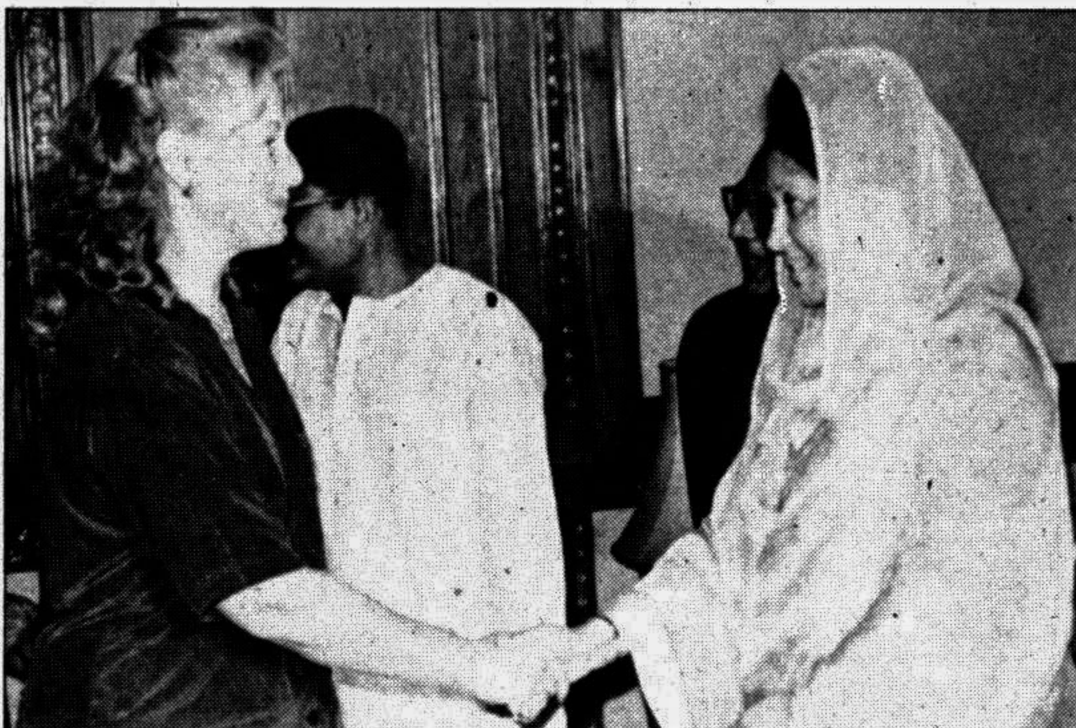
Prime Minister Begum Khaleda Zia exchanging Eid greetings with the foreign diplomats and representatives of different international organisations at her Sugandha Office in the capital on Eid Day Monday.