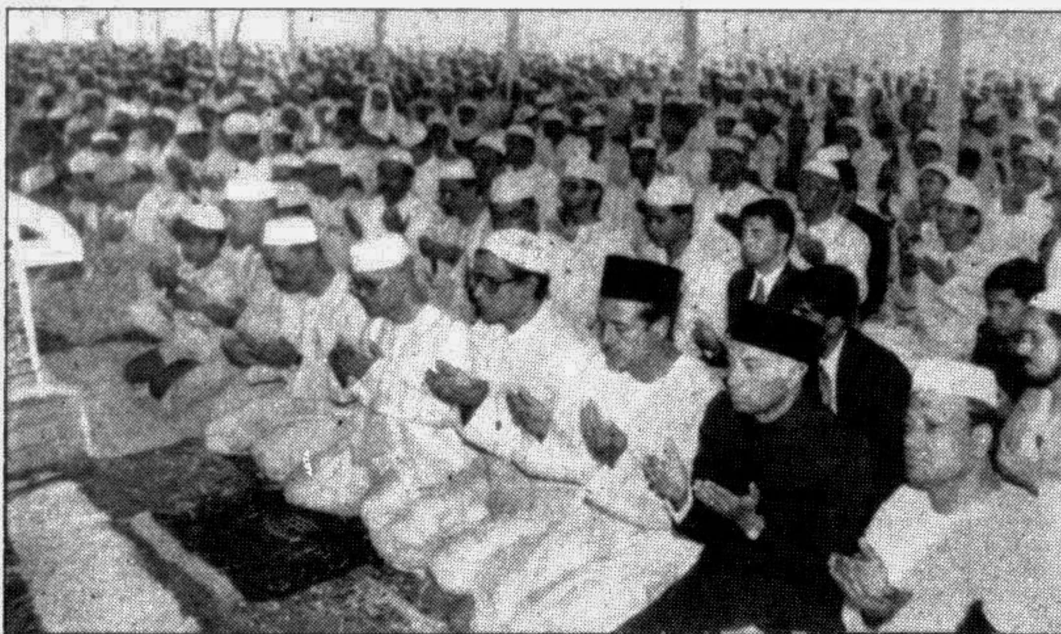
The main Eid congregation at the National Eidgah Maidan in the city on Monday.