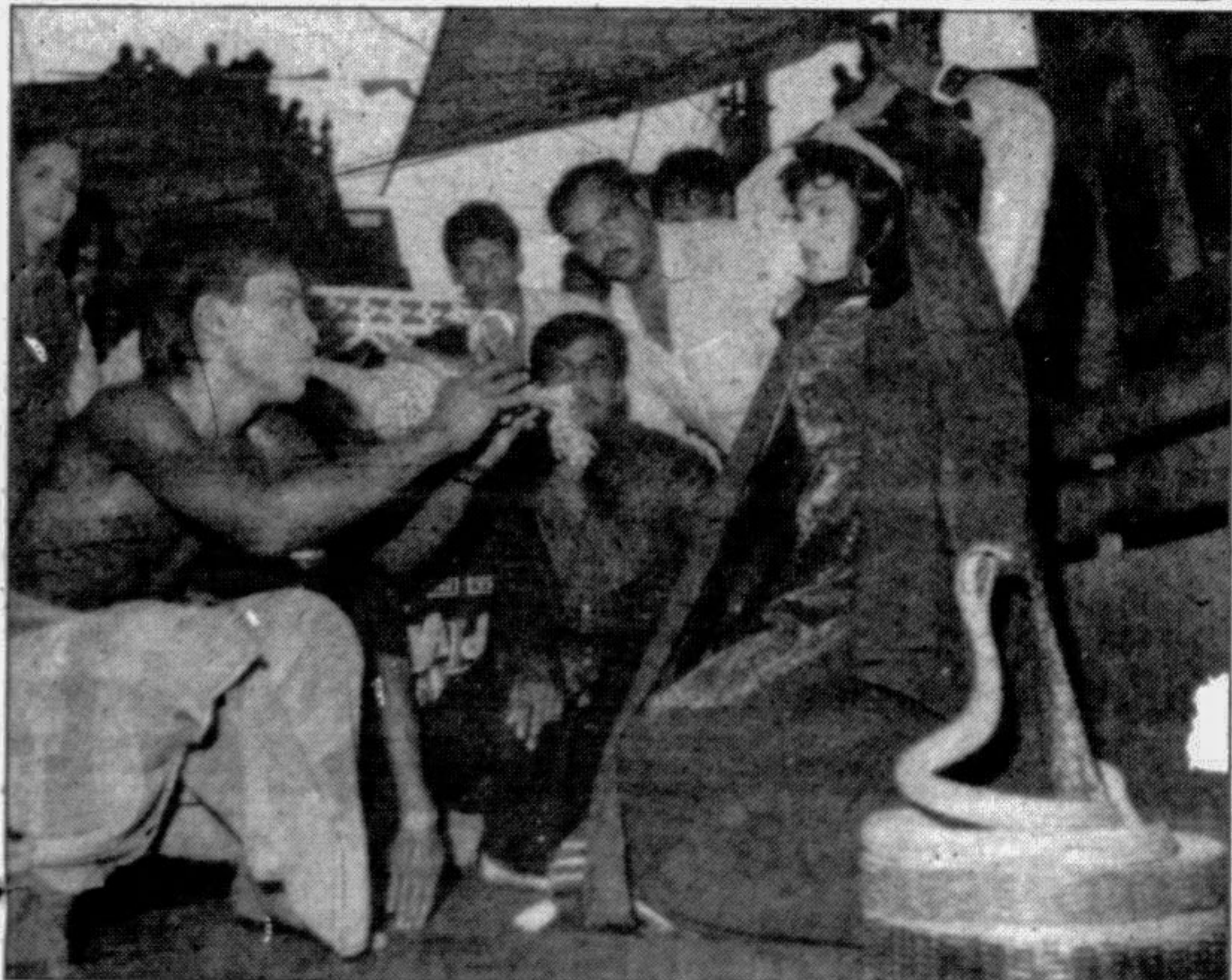
A fair was arranged in the city yesterday to mark the Eid-ul-Fitr.