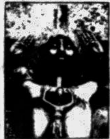
Beyond Tradition Page 3