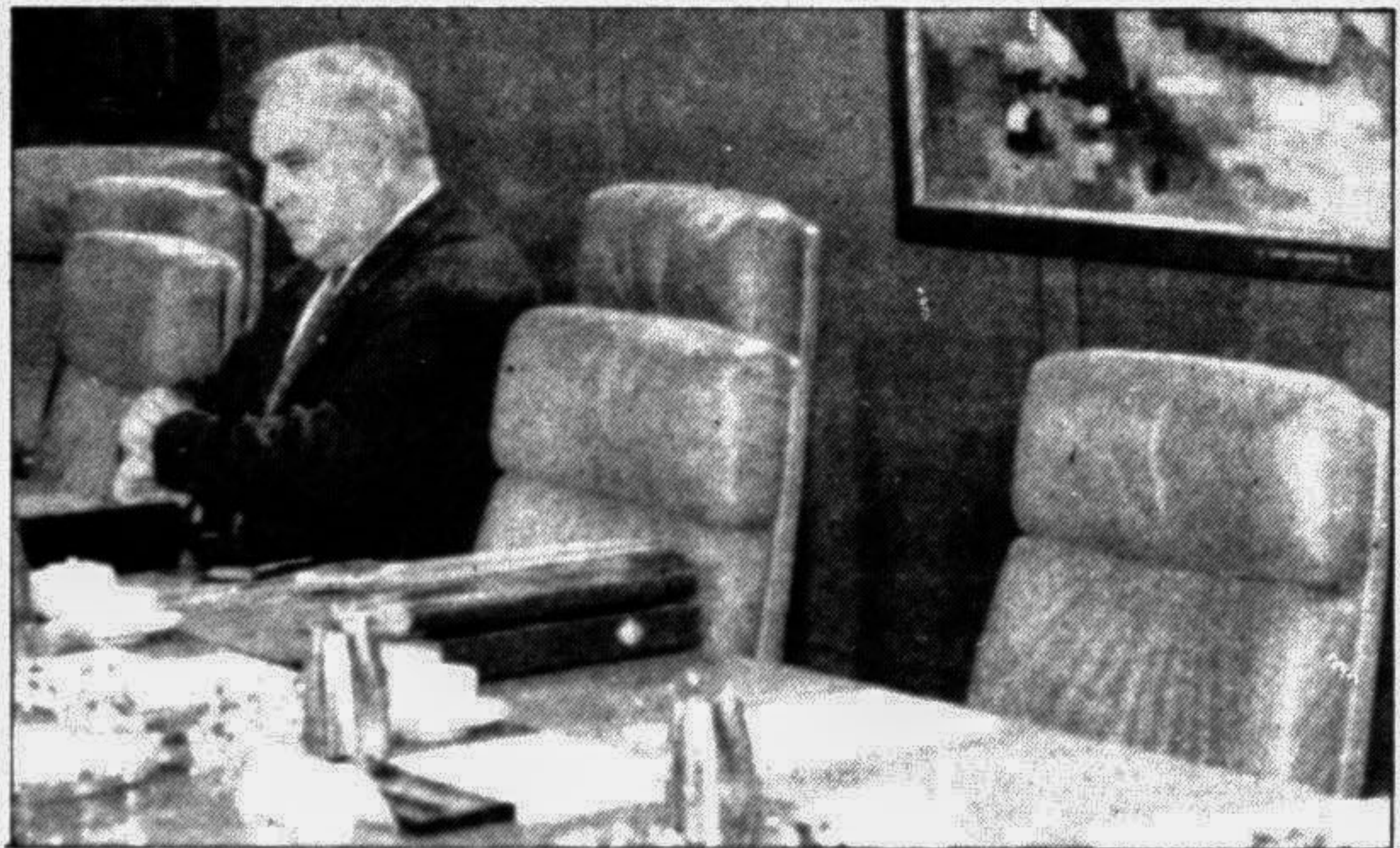
German Chancellor Helmut Kohl checks his watch while sitting alone at the cabinet's conference table in the Bonn Chancellery Tuesday, waiting for his ministers to arrive. The cabinet was to discuss the publication of the so-called 'Weissbuch', a government White Paper on the German Armed Forces.

Palestinians said another 30 were wounded during day-long clashes in Gaza's Jabalya Refugee camp.