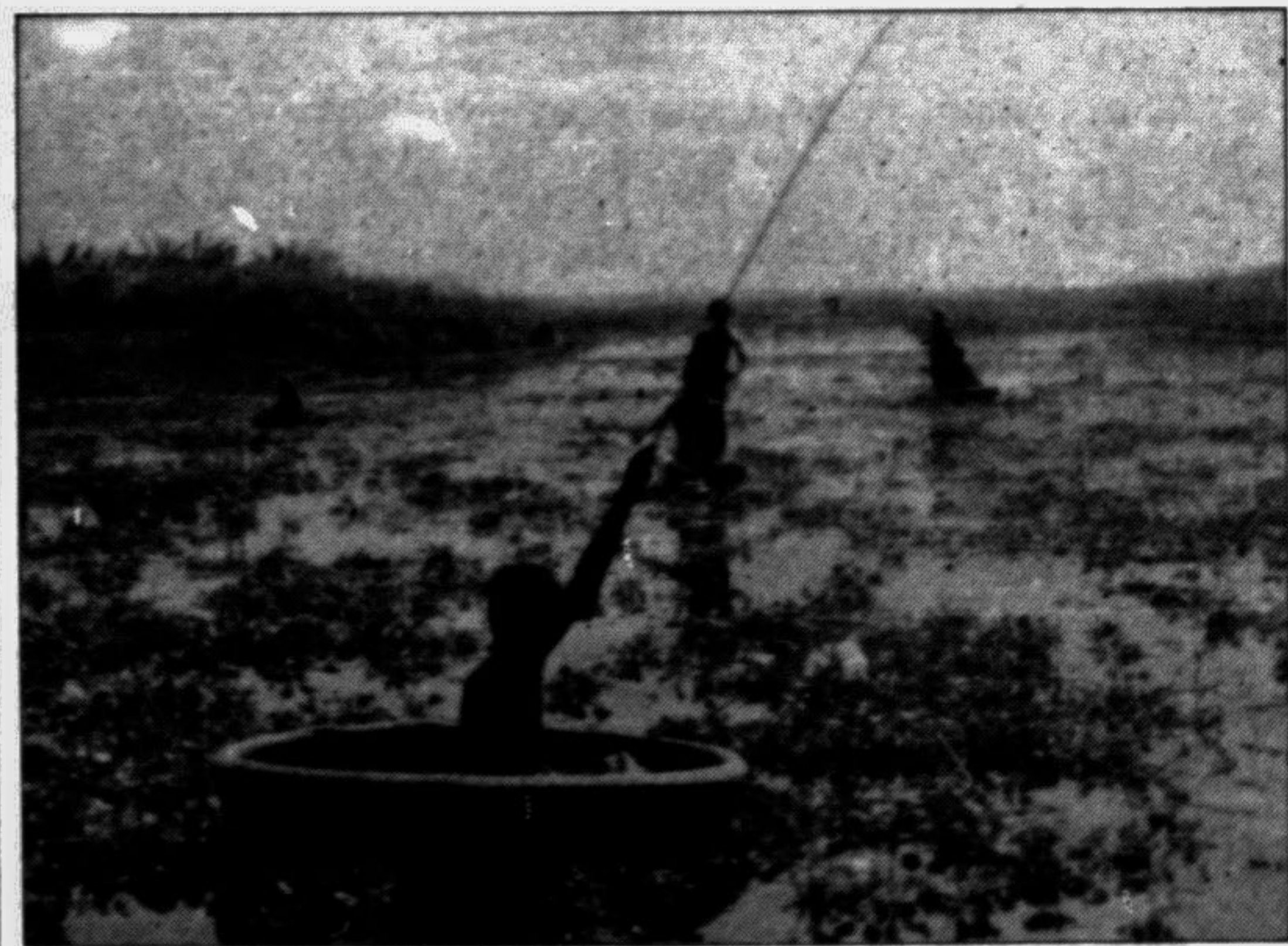
NATORE: The people of the district especially the children use charies, big earthen wares in fishing which is a common scene here.