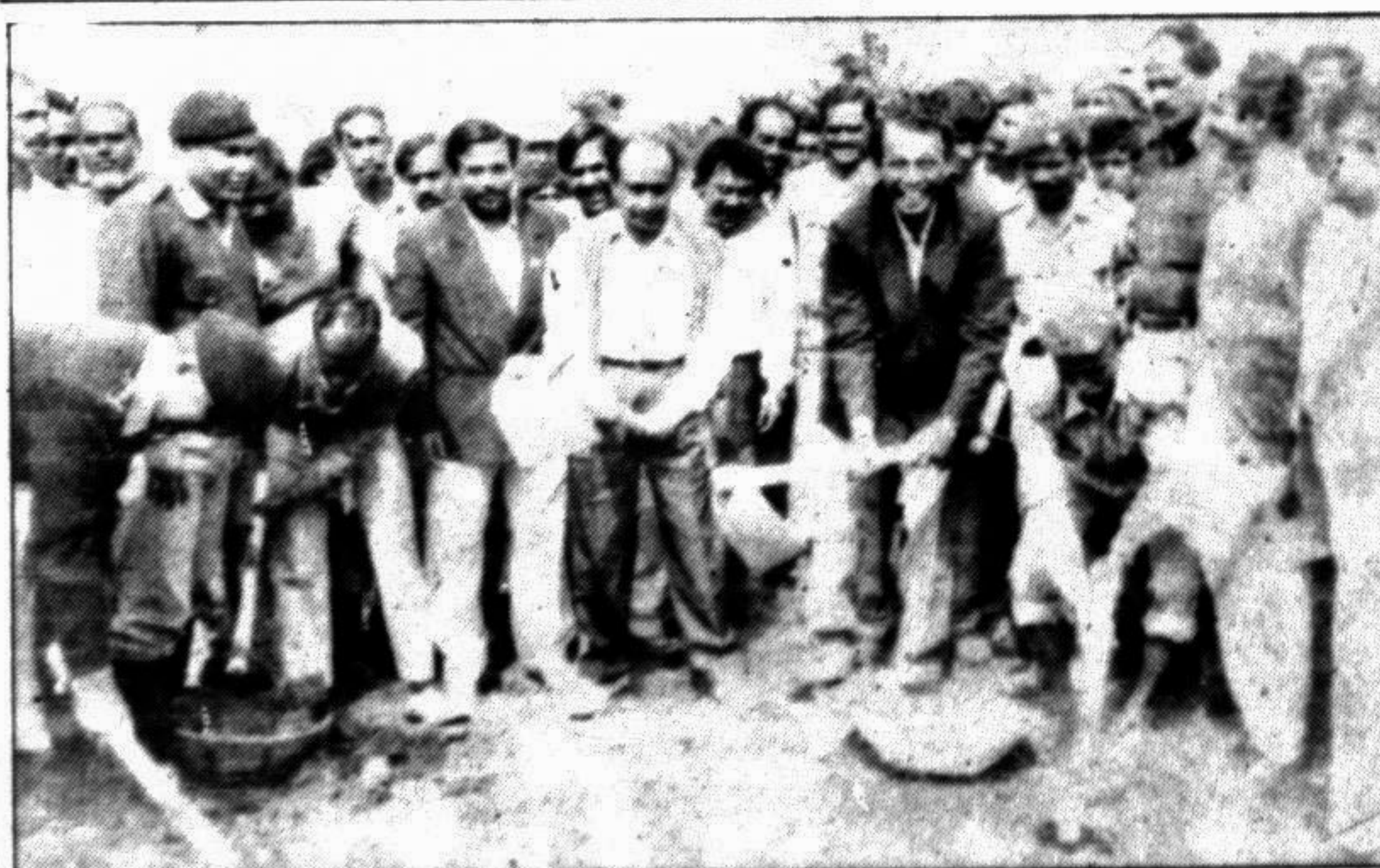
SYLHET: Suranjit Sengupta MP inaugurating the re-excavation work of a canal in Darai thana of Sunamganj district recently. The DC Kamaluddin is also seen in the picture. — Star photo

Among them, 608 students have received talentpool scholarship while 2660 received general scholarship, the sources said.