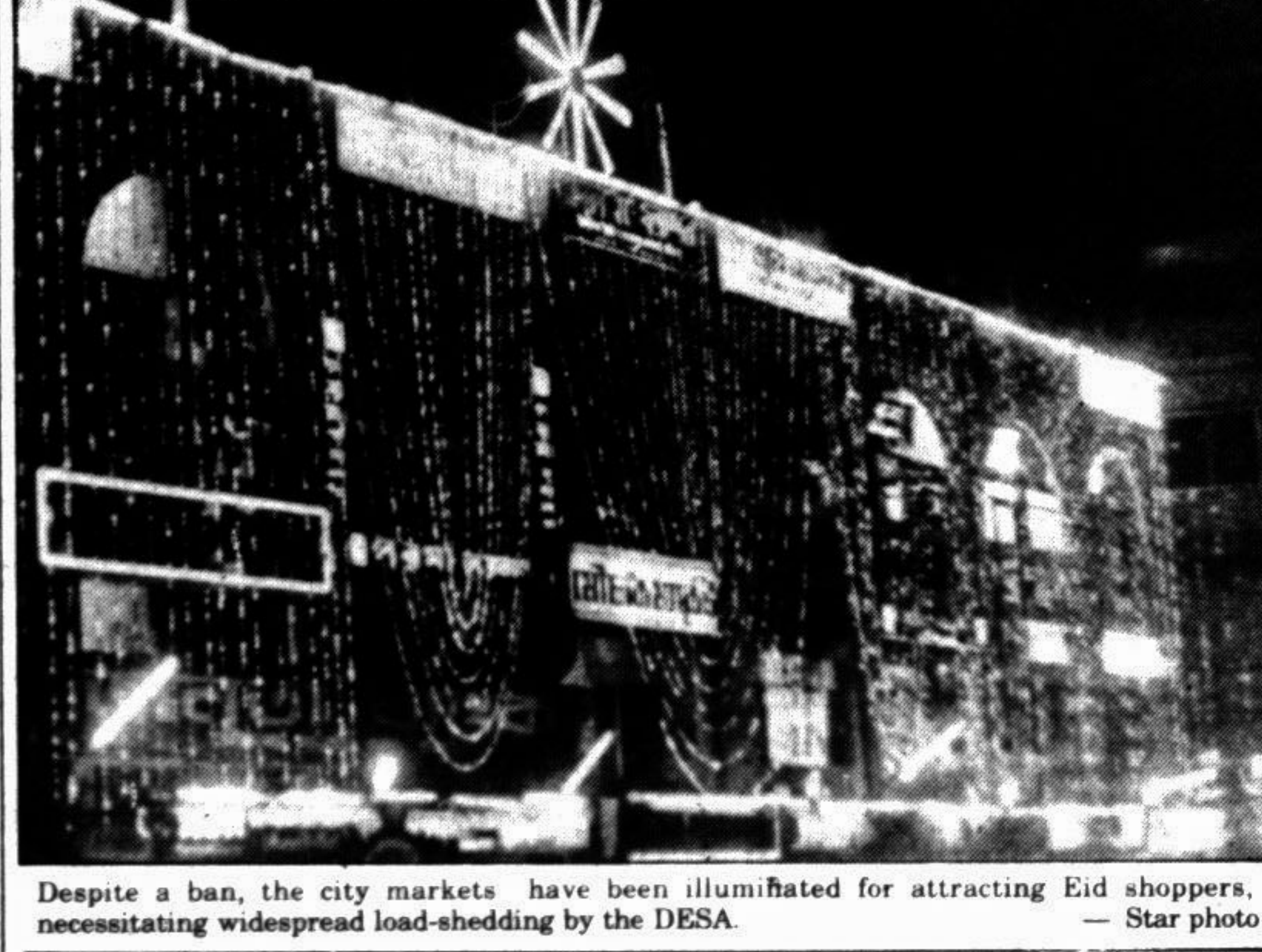
Despite a ban, the city markets have been illuminated for attracting Eid shoppers, necessitating widespread load-shedding by the DESA.