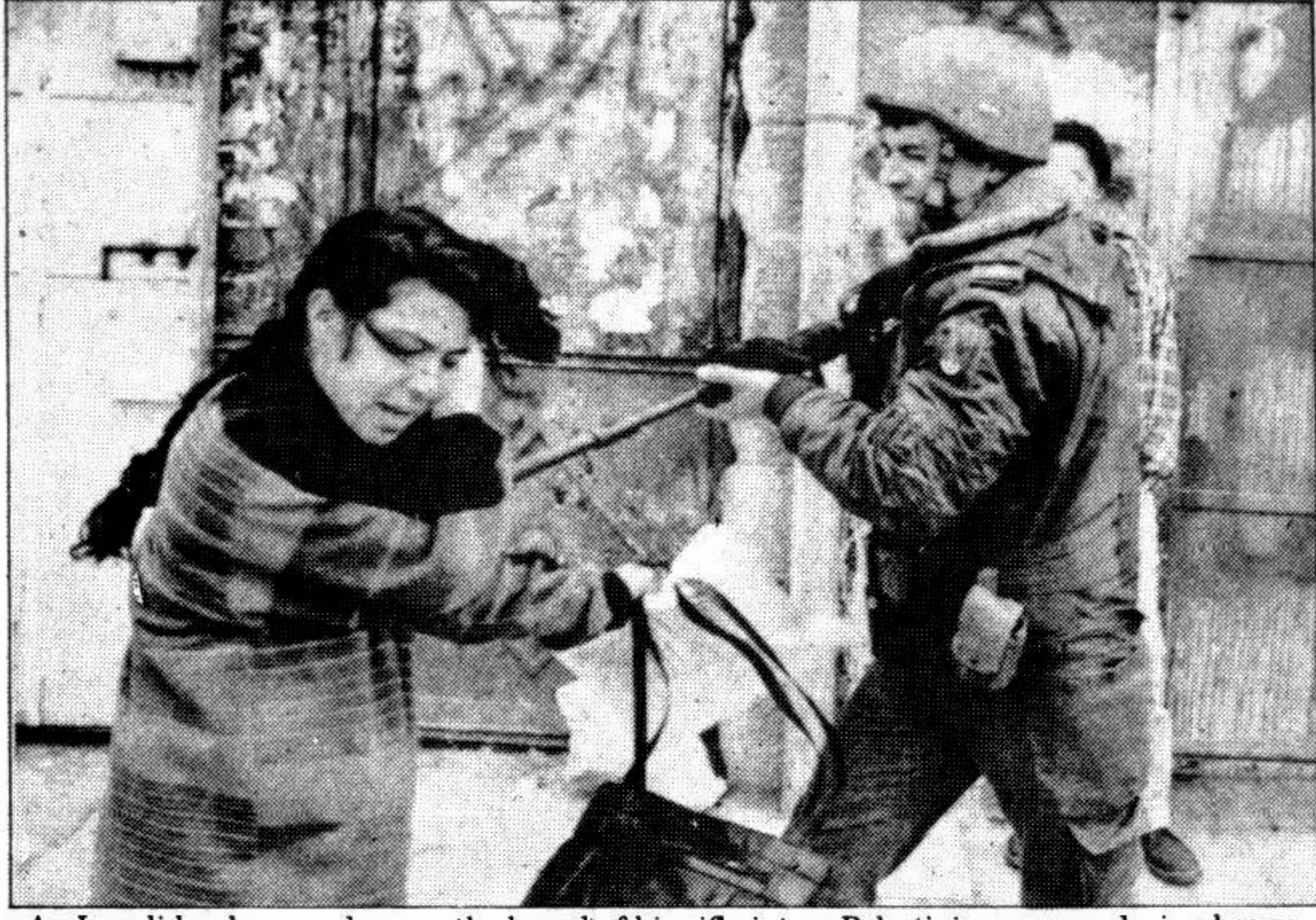
An Israeli border guard rams the barrel of his rifle into a Palestinian woman during heavy clashes that erupted in East Jerusalem's main street following a march on the International Women's Day Tuesday.

FENI, Mar 9: Prime Minister Begum Khaleda Zia visited remote areas of three thanas here today and made a fervent appeal to the rural people to adopt family planning and keep their families small, reports UNB. "Both the country and individual families will be benefited if we keep our family small," she said pointing to the country's number one problem — population boom. Begum Zia briefly addressed the people at 10 places — Anandayapur Bazar, Natun Munshirhat, Fulgazi high school ground, Chitolia high school ground, Purba Shaheb Nagar, Parshuram Zila Parishad ground, Khandal Hye Bazar, Amzad Hat, Adalat Bhaban and Bangla Bazar under Parshuram, Fulgazi and Chagalaia thanas. The villagers came out of their homes to greet Begum Zia as she drove through different rural roads. Begum Zia shook hands with women, hugged small children and conveyed to them advance Eid greetings. The Prime Minister urged the people to cooperate with her government from their're- See Page 12 Col 7