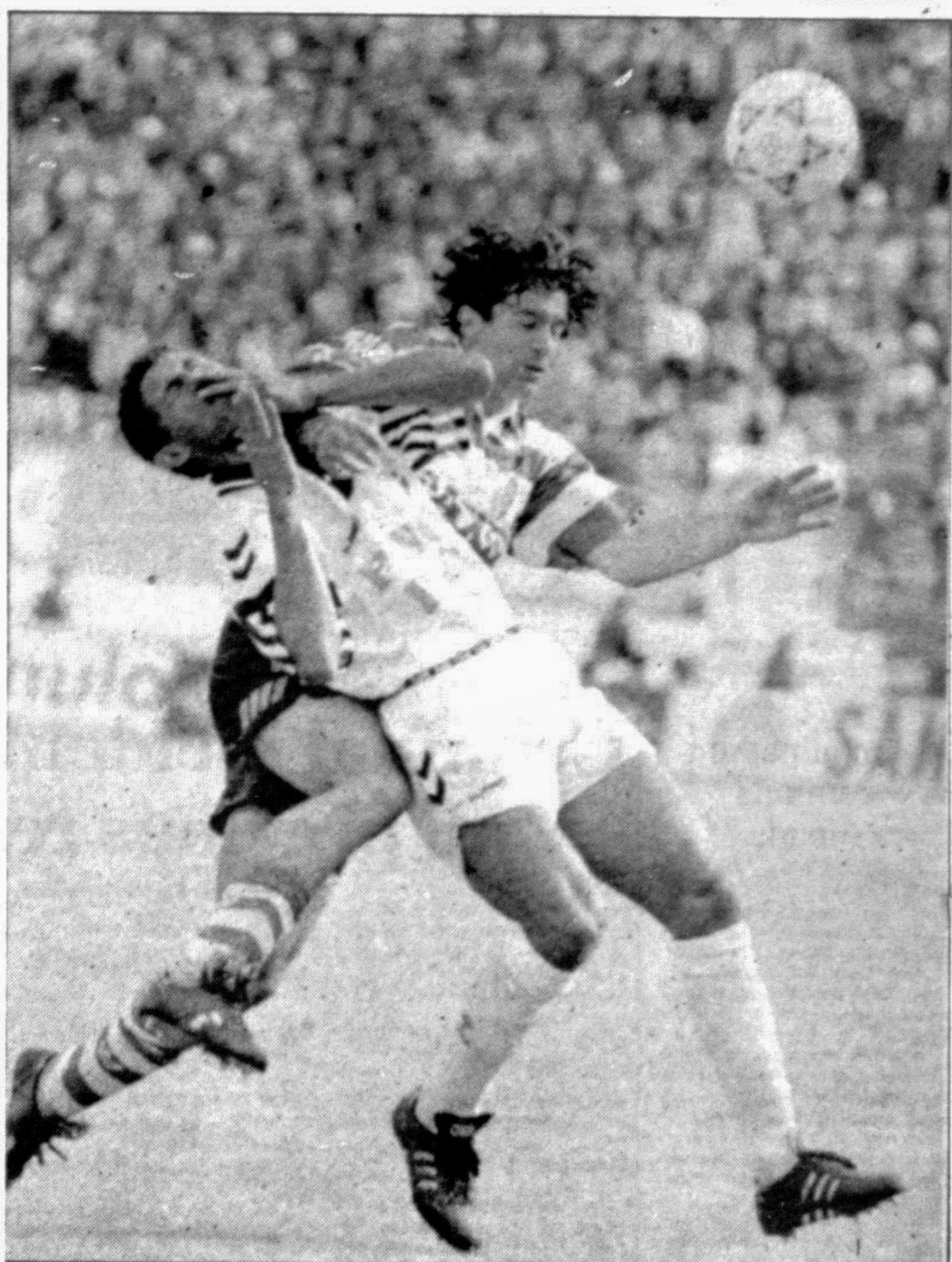
Luis Figo of Sporting Lisbon and Barzil's Luisao (L) of Farense engaged in a tussle during their Portuguese Premier League encounter on March 6. Sporting won the match 3-1.