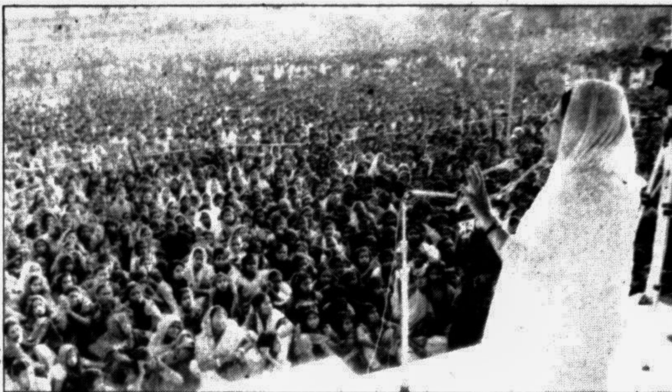
BNP chairperson Prime Minister Begum Khaleda Zia addressing a public meeting at the Arpara Ideal High School ground in Shalikhathana under Magura district yesterday.