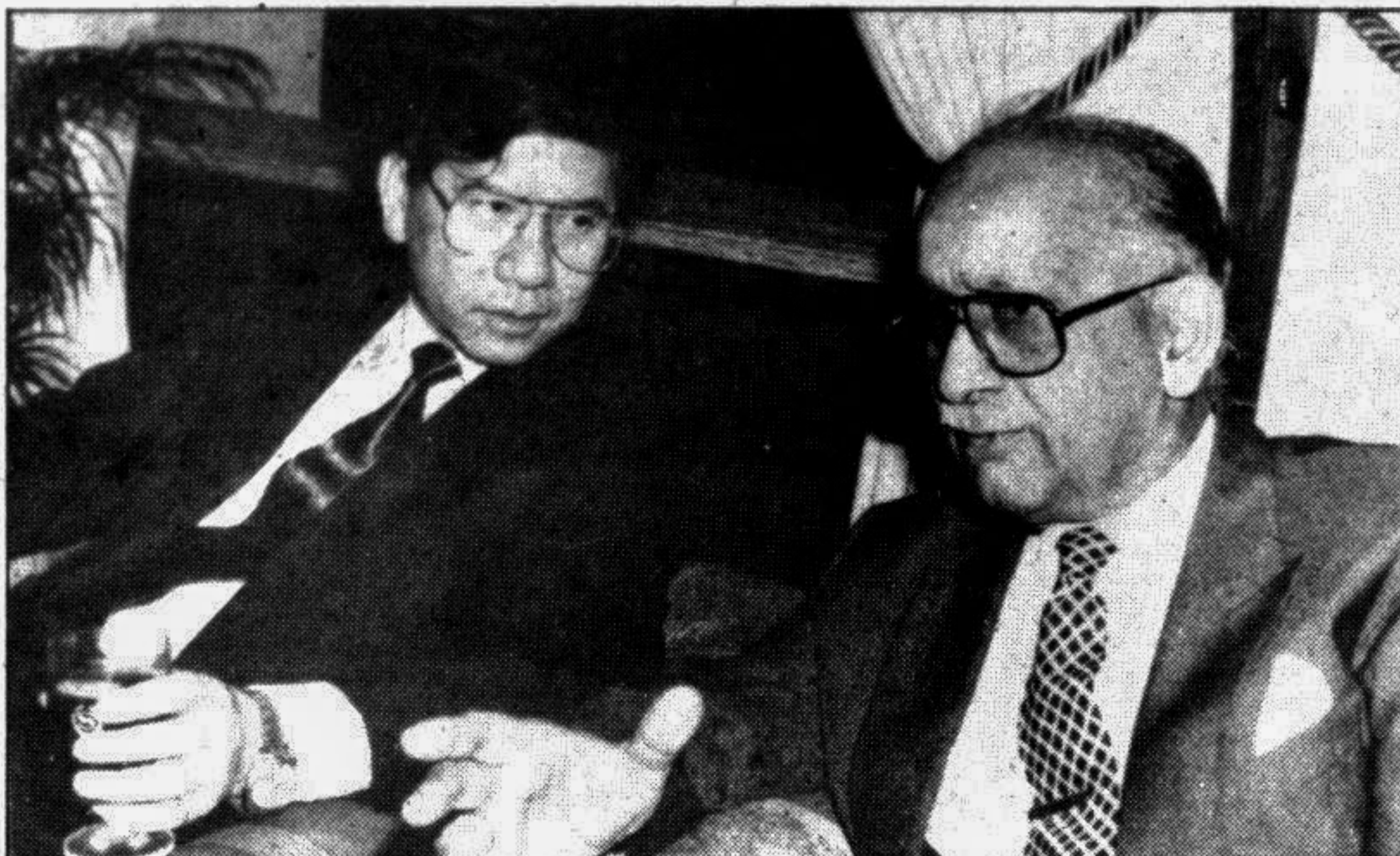
Canada's Secretary of State for Asia-Pacific Raymond Chan called on Foreign Minister A S M Mostafizur Rahman at his office yesterday.