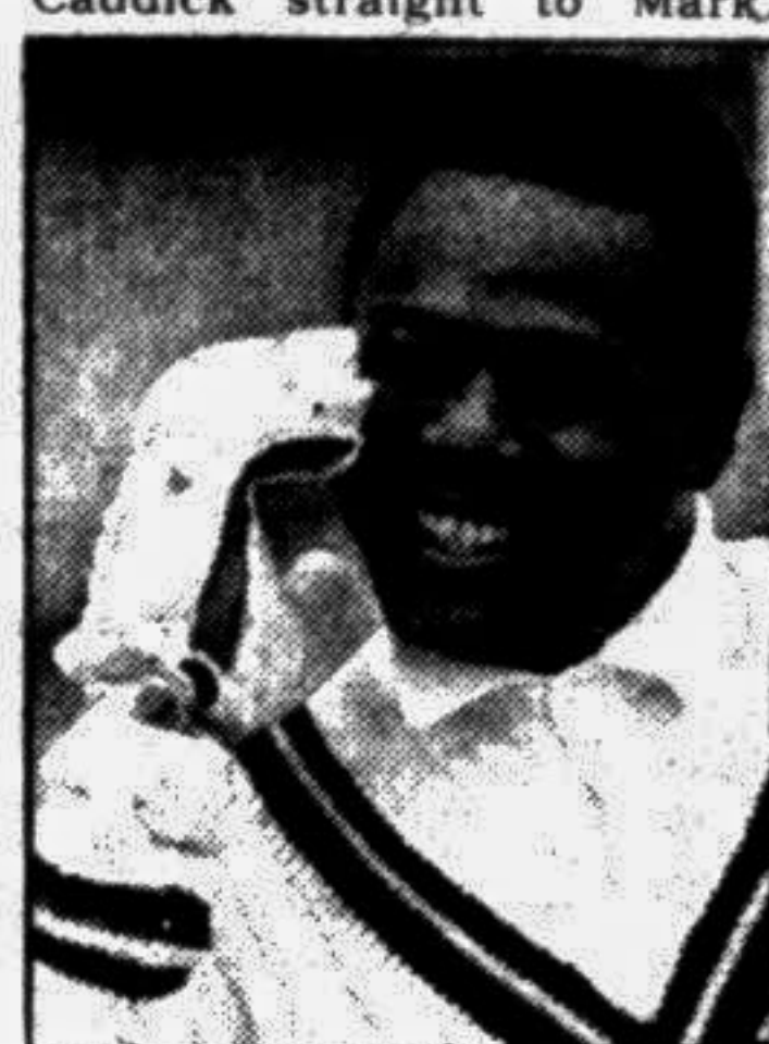
HAYNES ... m-o-m

hope for England when Simmons was caught by Graeme Hick at slip off Chris Lewis and Angus Fraser then removed Brian Lara (19) and Keith Arthurton (0) in the space of three balls.