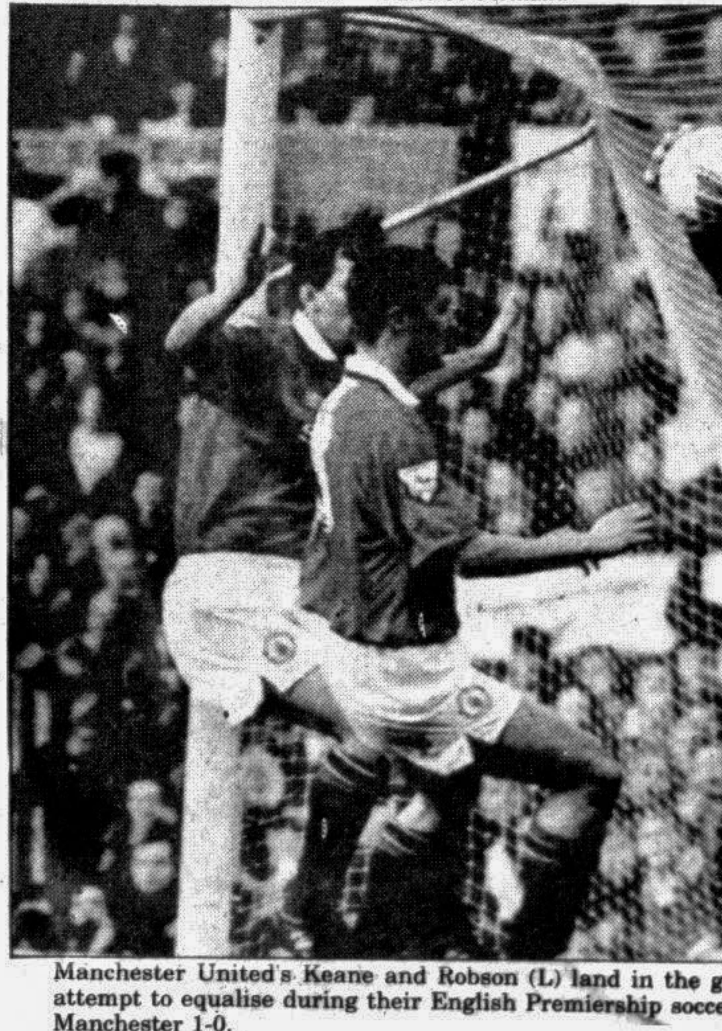
Manchester United's Keane and Robson (L) land in the goal while goalkeeper Dimitri Kharine of Chelsea stop their attempt to equalise during their English Premiership soccer match in Manchester, England on Saturday. Chelsea beat Manchester 1-0.