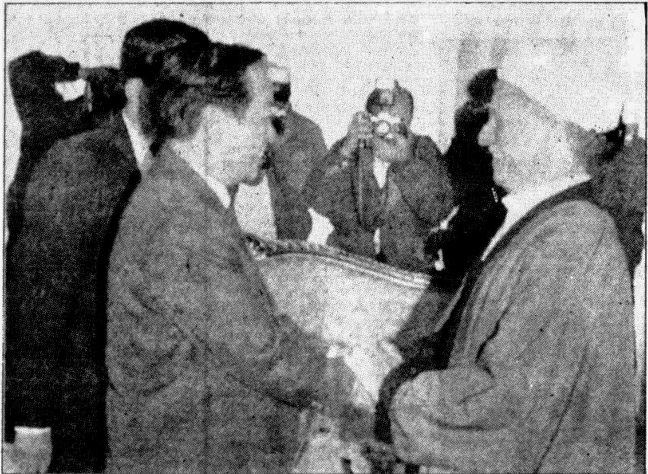
Chinese Foreign Minister Qian Qichen (L) is greeted by Iranian President Ali Akbar Rafsanjani in Tehran on Saturday.