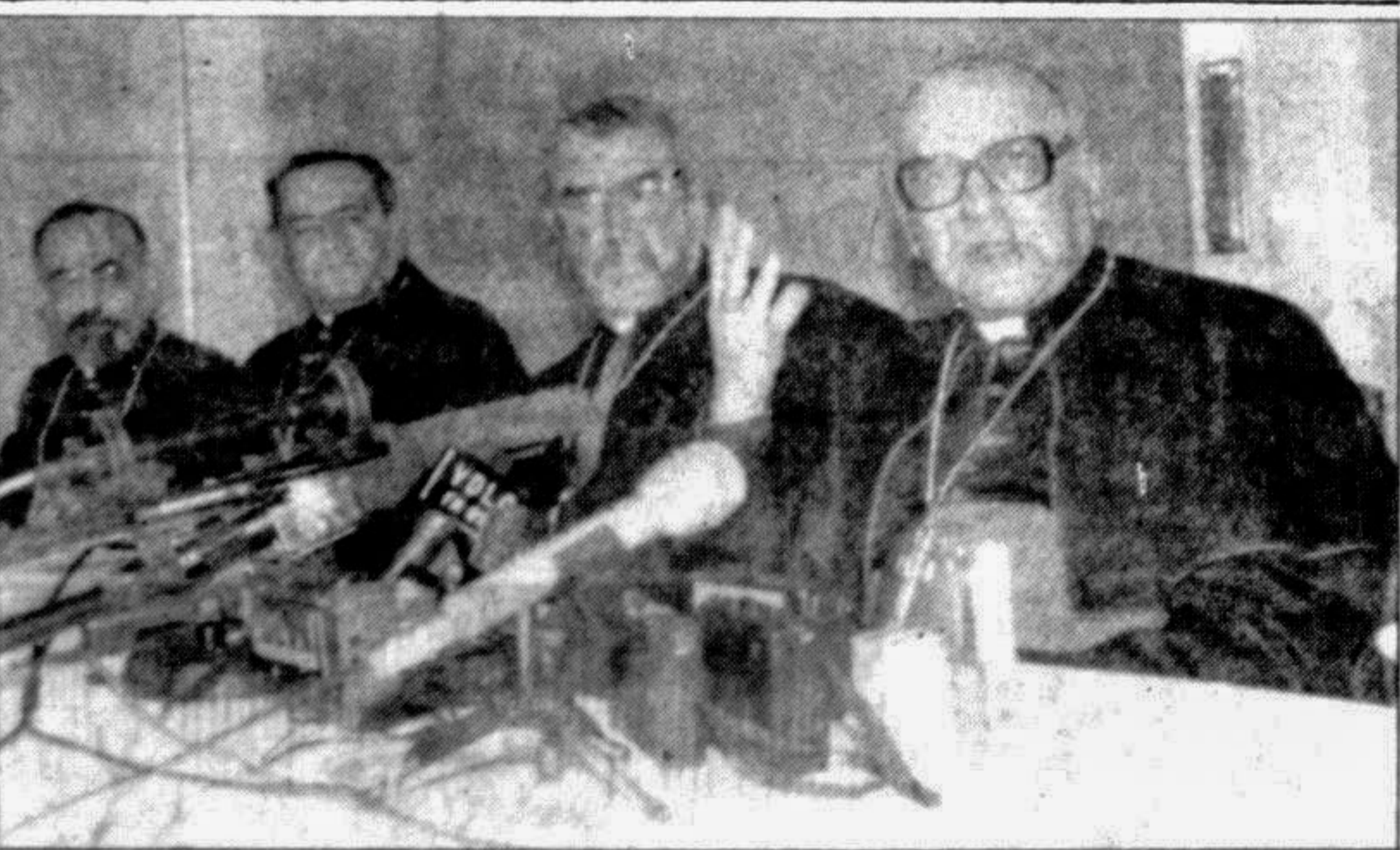
The Latin Patriarch of Jerusalem Michel Sabbah (R) and other Christian patriarchs from the Middle East answer questions during a press conference in Baghdad on Saturday.