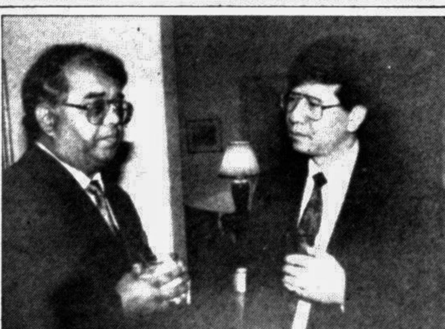
Information Minister Barrister Nazmul Huda chats with the Canada's Secretary of State for Asia Pacific Raymond Chan at a dinner hosted by the Canadian High Commissioner in the city yesterday.

All the arrested people were produced before court.