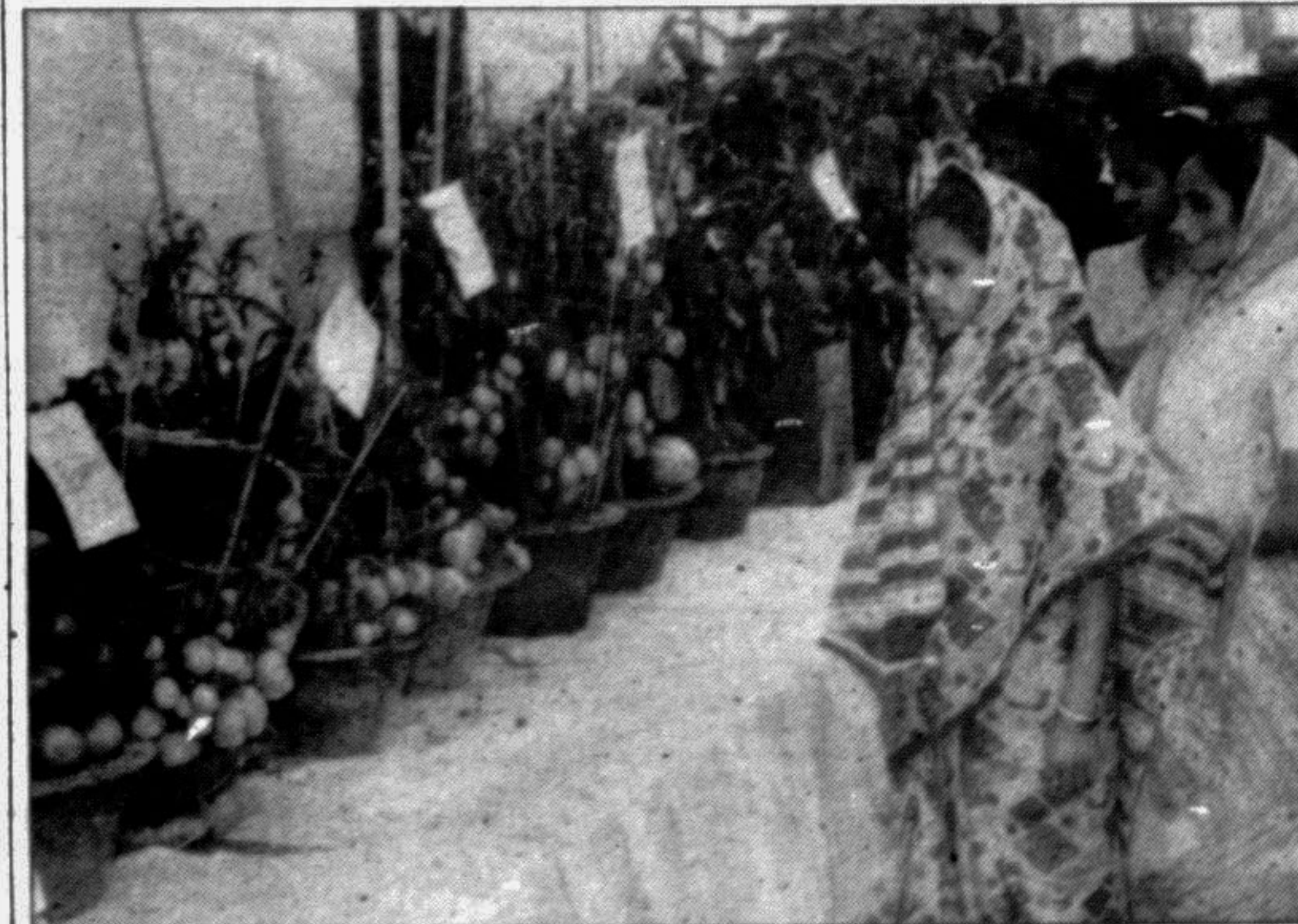
BRAHMANBARIA. Visitor at the four-day-long agriculture fair held here recently.

Smuggled goods from India including sarees, salt, sugar spices and other materials are carried on most of these trains. Theft of diesel and rail slippers is said to be rampant on Sirajganj-Ishurdi, Ishurdi-Faridpur, Sirajganj-Chapainawabganj, Santahar-Dinajpur, Lalmonirhat-Panchagarh and Rajshahi-Goalundo rail routes.