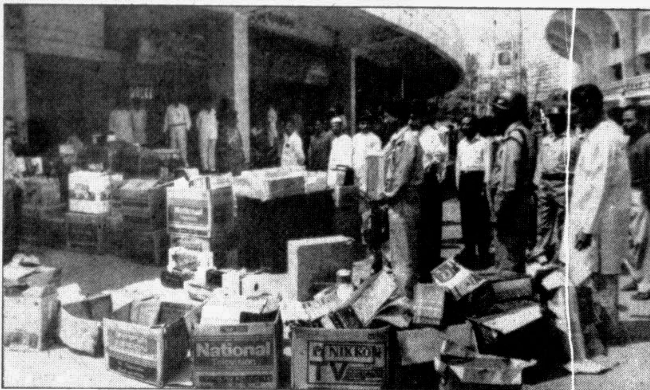
Goods worth about Tk 15 lakh of an electronics shop at the Outer Stadium was gutted yesterday.