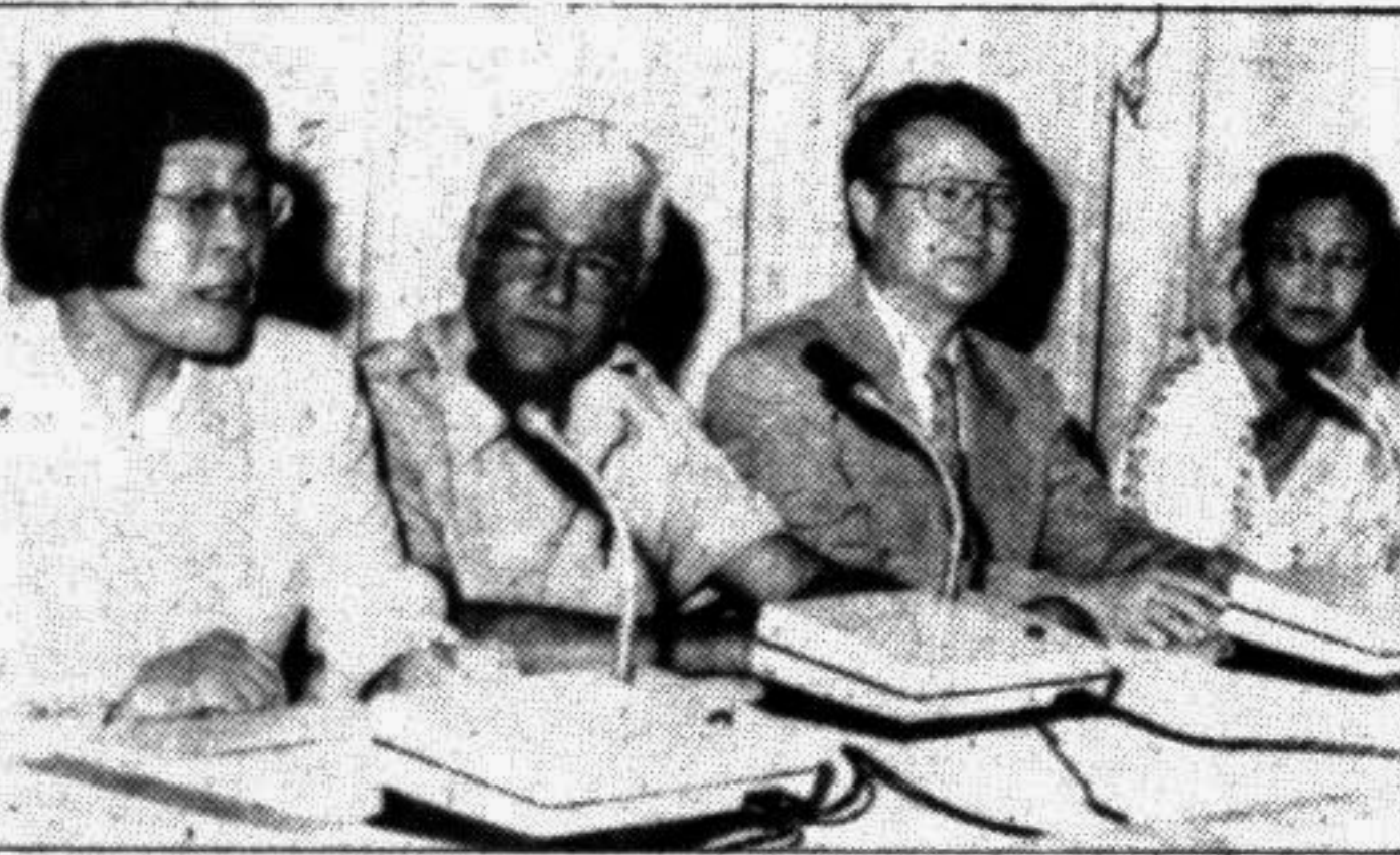
The Japanese Embassy in Dhaka held a symposium on 'Oshin and Development - Sharing the Japanese Experience' at Hotel Sheraton yesterday.