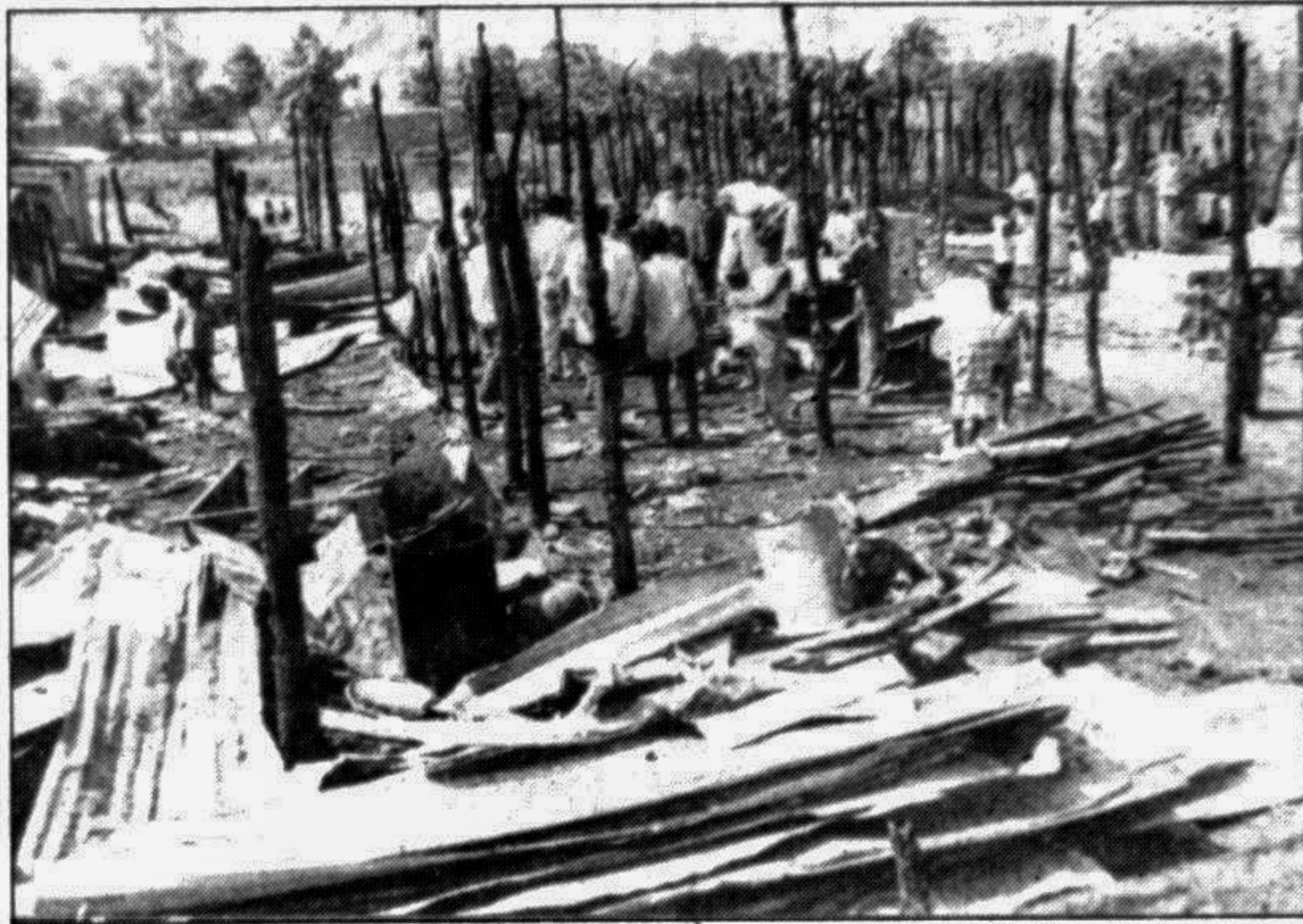
A fire gutted 20 shacks in a slum at Paikpara, Mirpur in the city Wednesday.