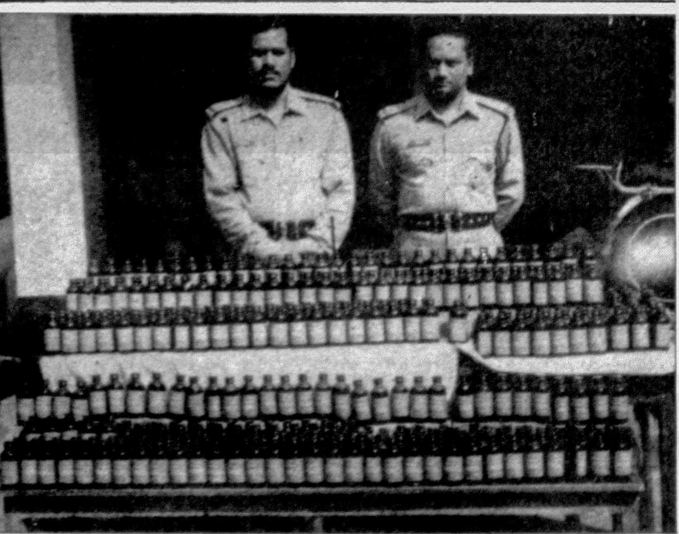
BRAHMANBARIA: The local police seized 400 bottles of smuggled phenidyl syrup recently.

Seven persons were also arrested during the period on charge of possessing illegal arms.